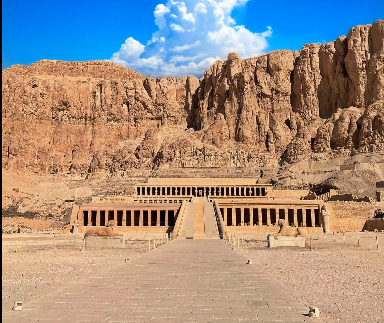
Temple of Hatshepsut - Luxor