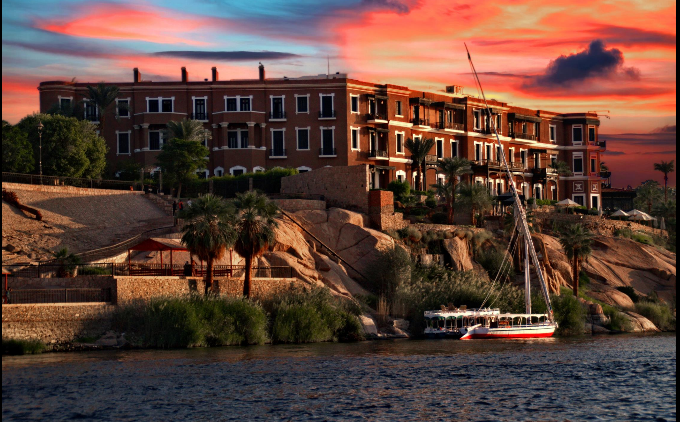
Old Cataract Hotel – Death on the Nile Film Location