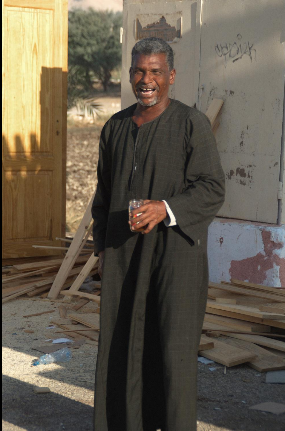
Memphis with Tour Vendor