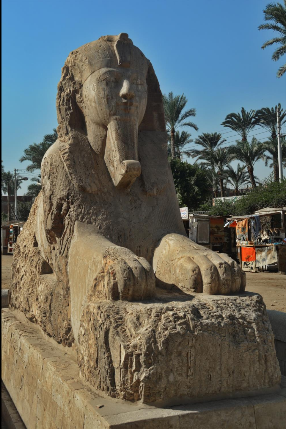
The Alabaster Sphinx @Memphis – Old Egyptian Capitol