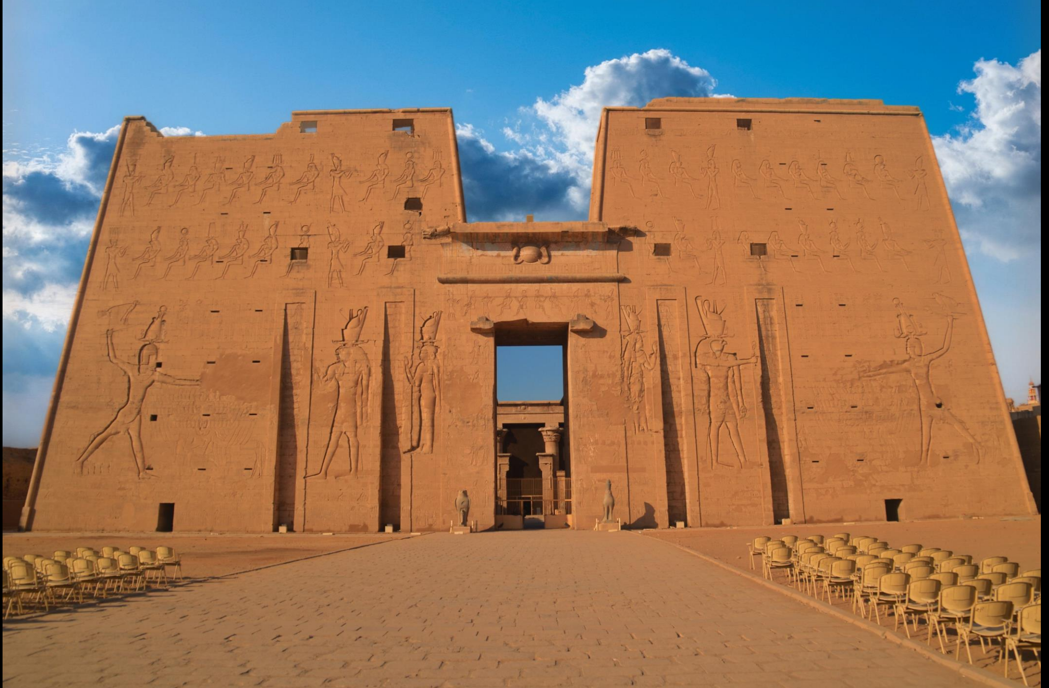
Temple of Horus –Kom Ombo