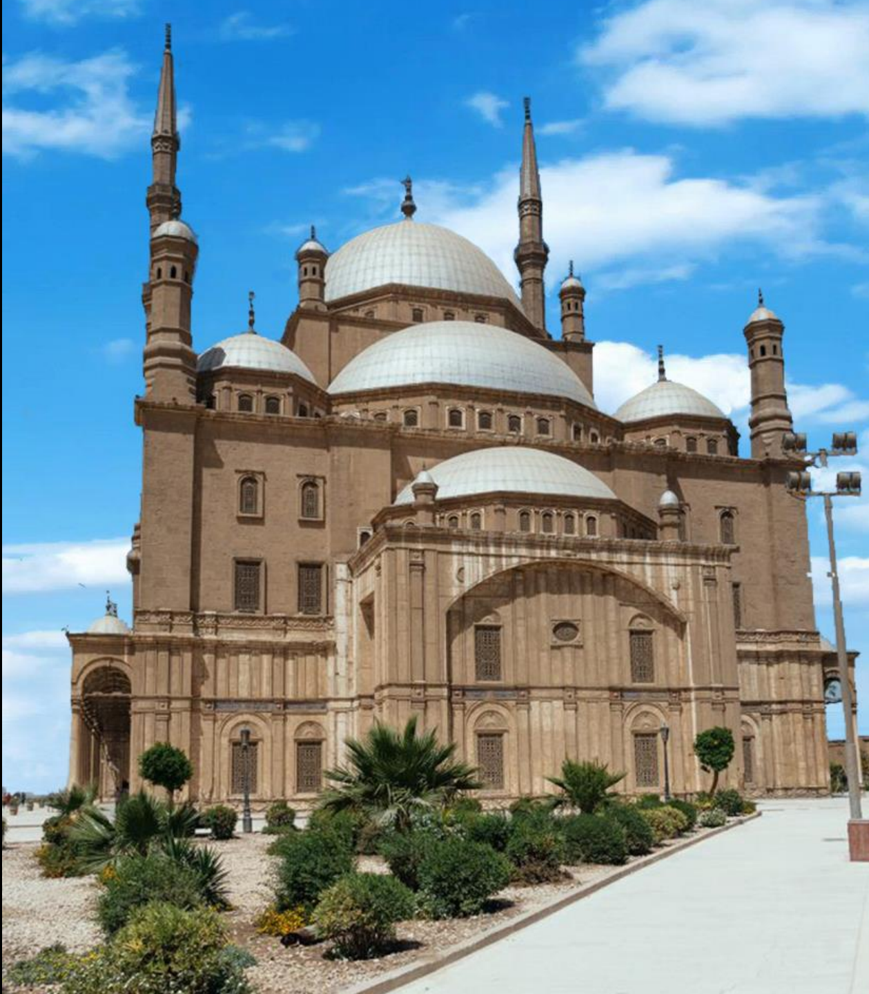
The Citadel Saladin - Cairo