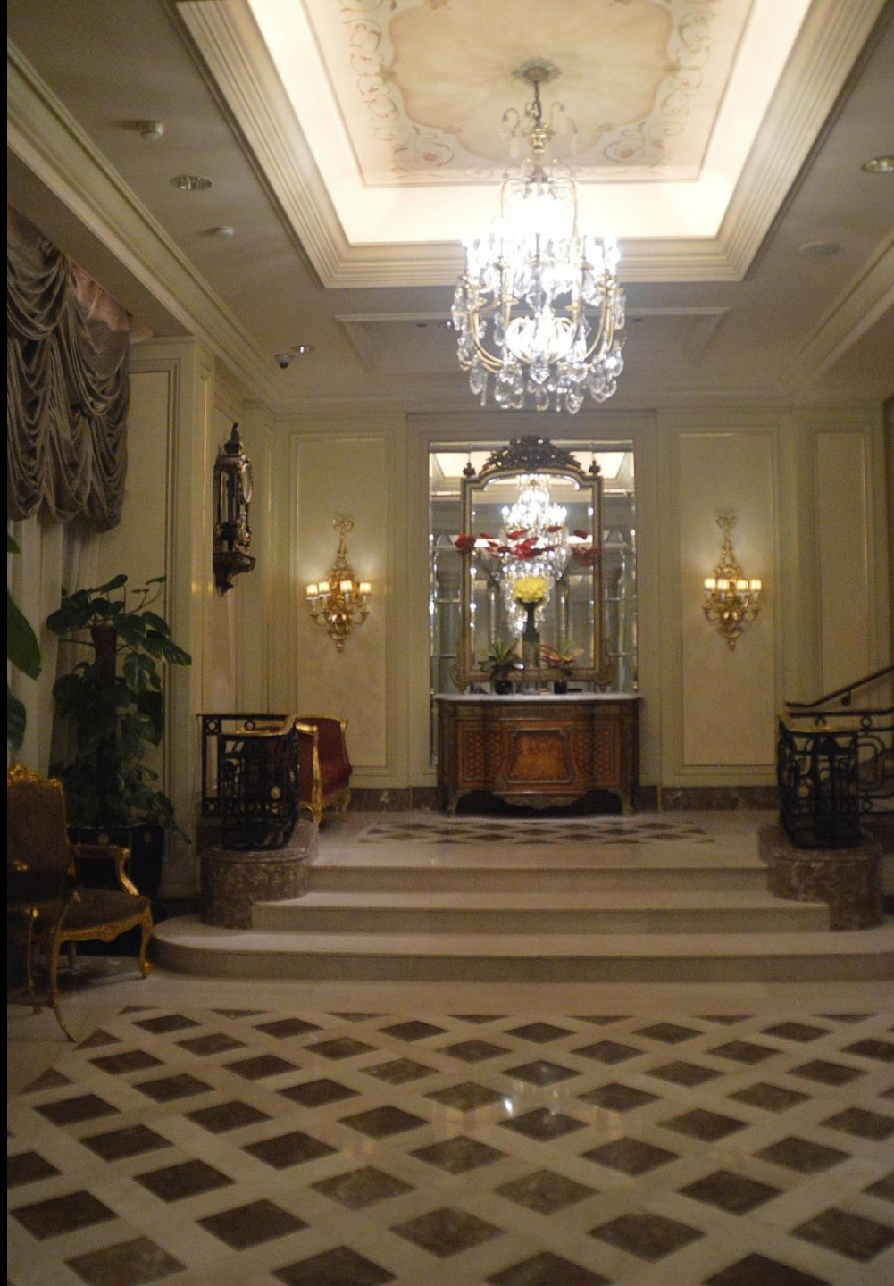
Lobby of the Four Seasons Hotel on the Nile