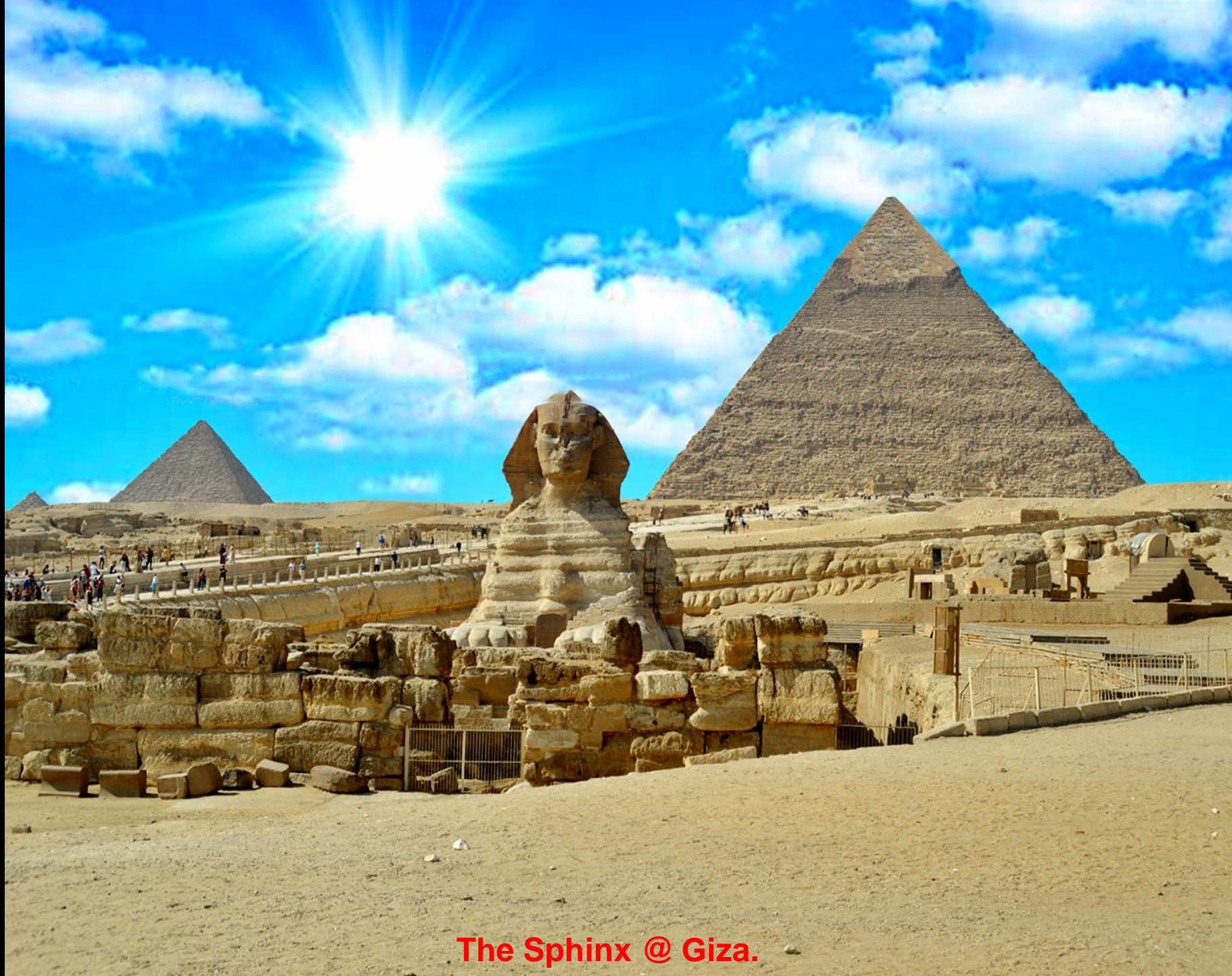
The Sphinx @ Giza.