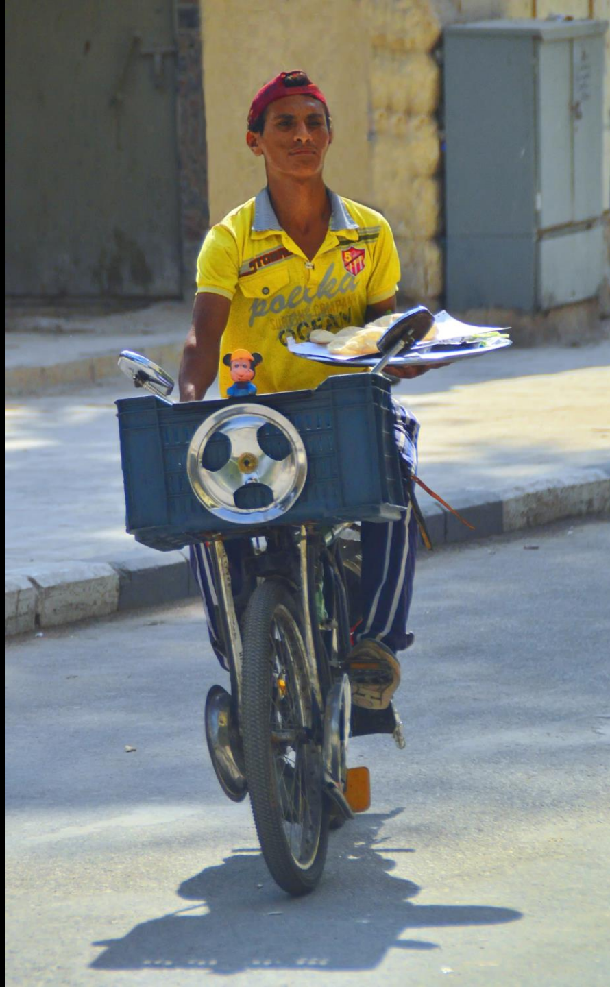
Old Coptic Cairo – Grub Hub Delivery