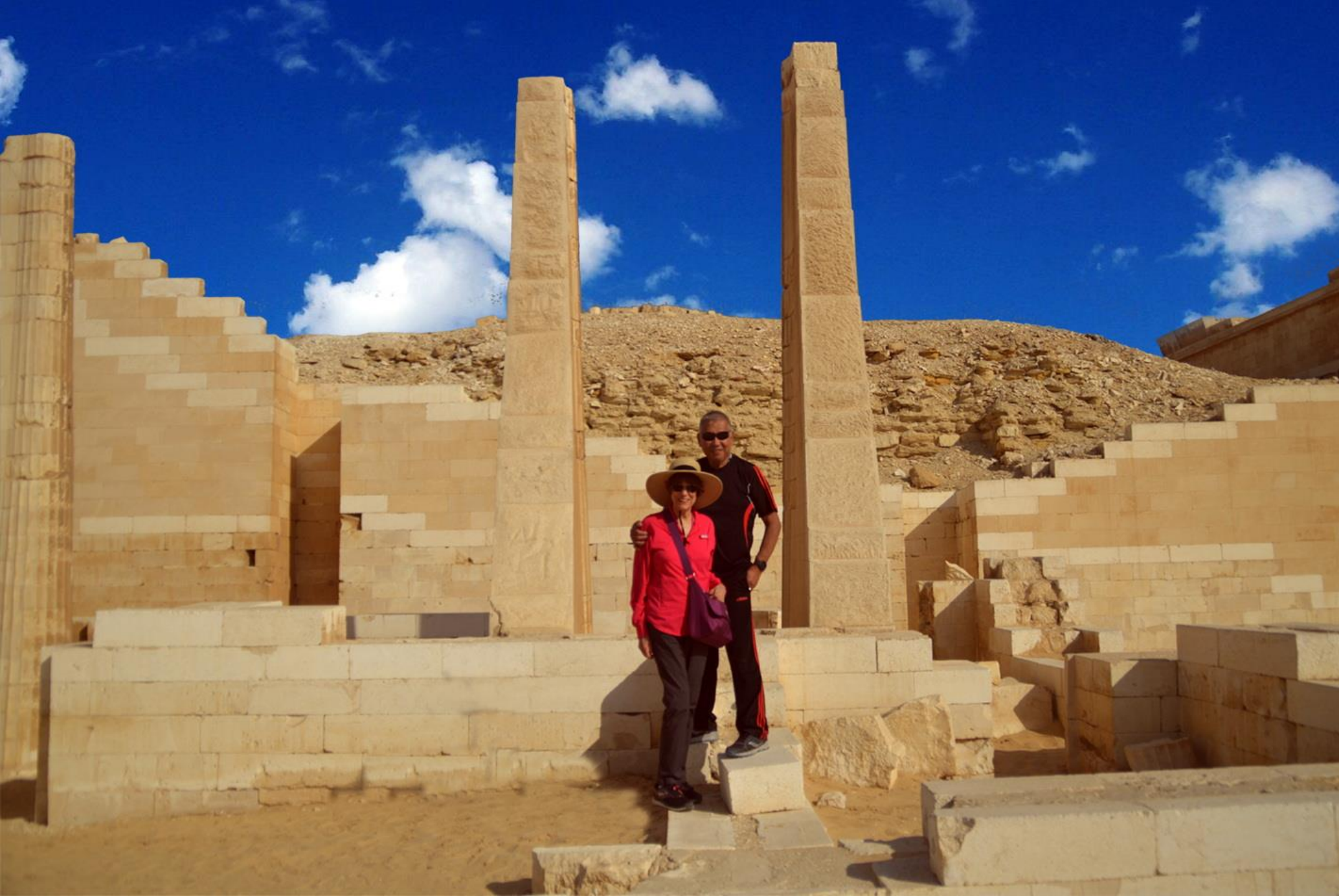
Steppe Pyramid Ceremonial Entrance @ Saqqara