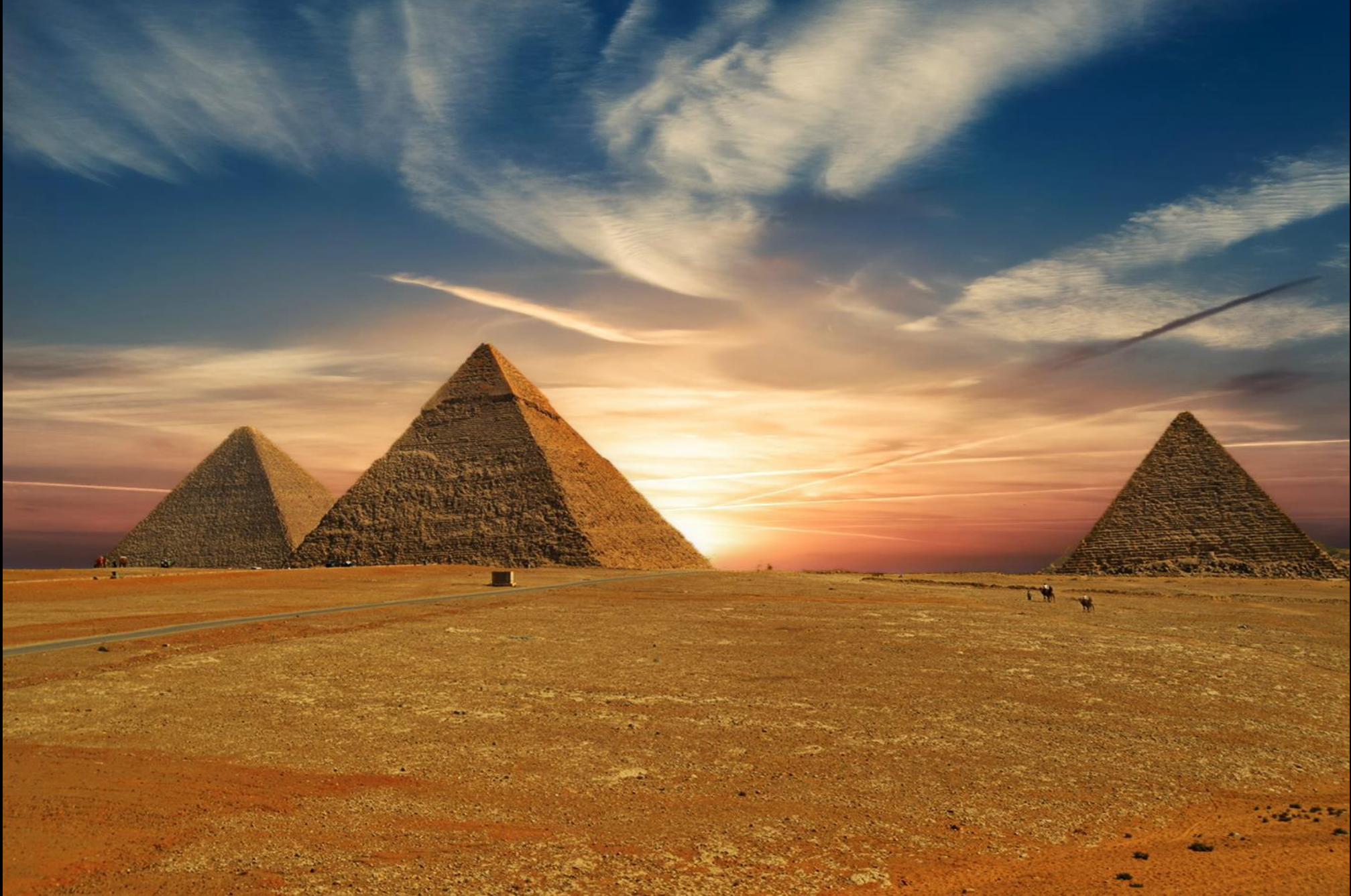
the Pyramid of Menkaure , the Pyramid of Khafre and the Great Pyramid of Khufu .