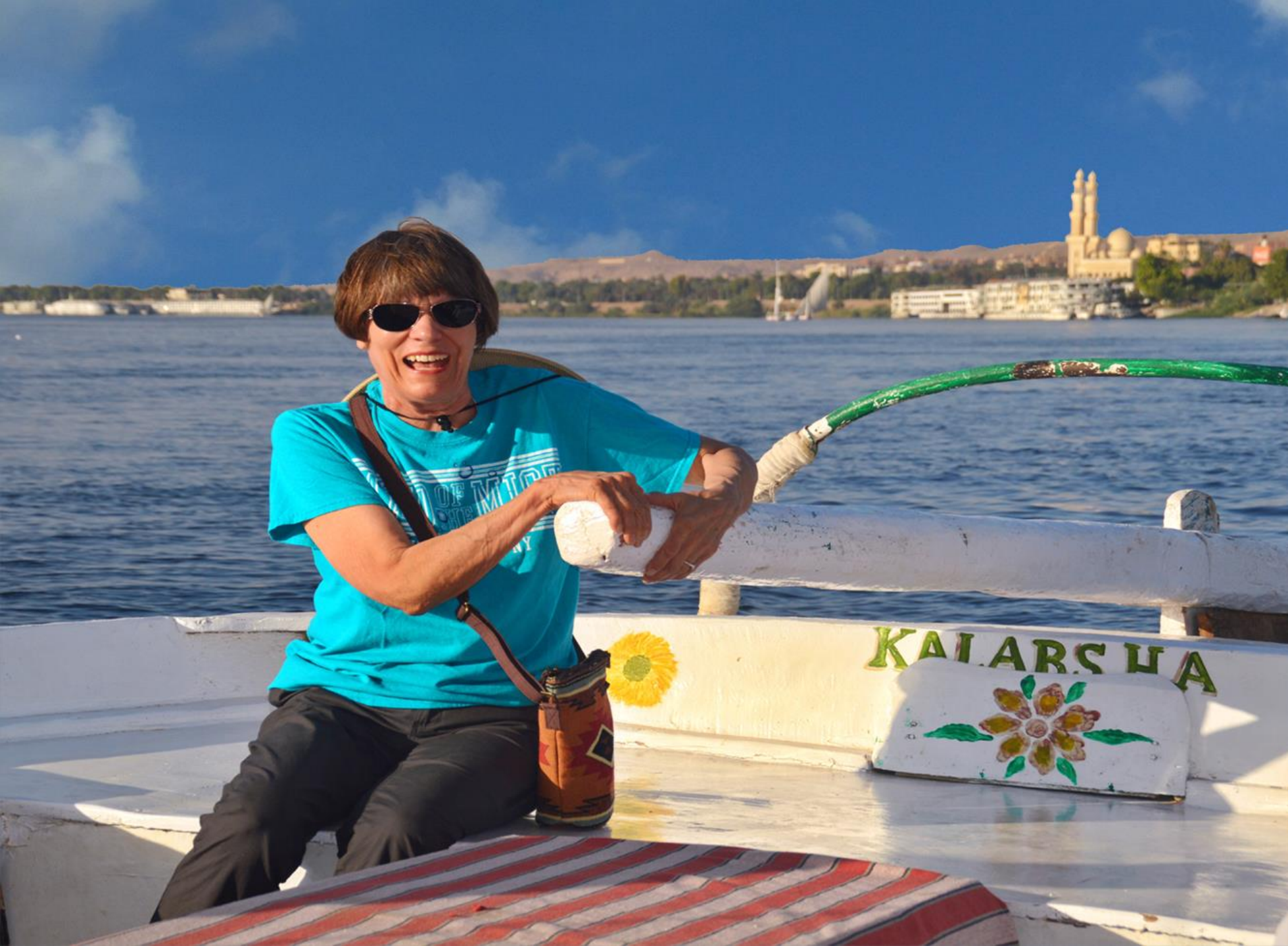
Felucca Sailing to Elephantine Island