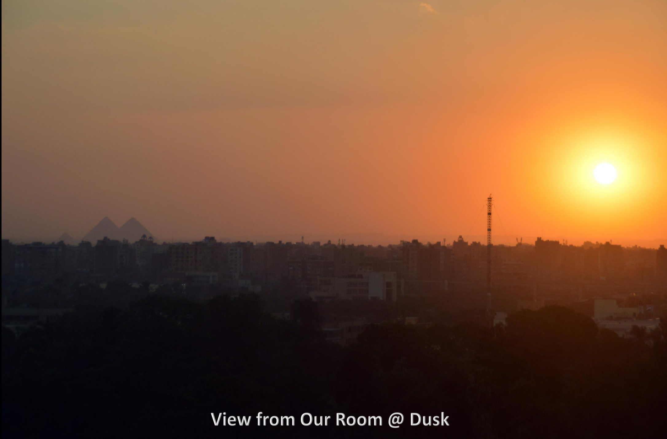
View from Our Room @ Dusk