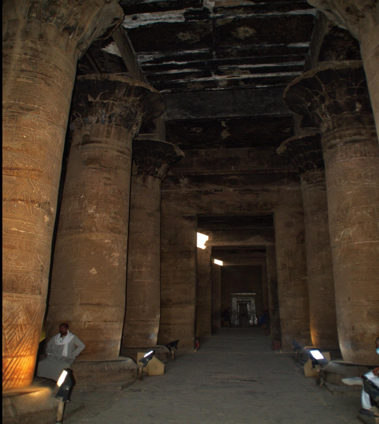
Temple of Horus –Kom Ombo