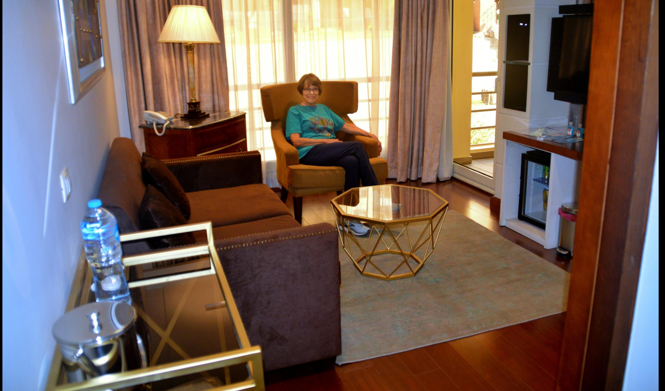
Our Portside Stateroom #410