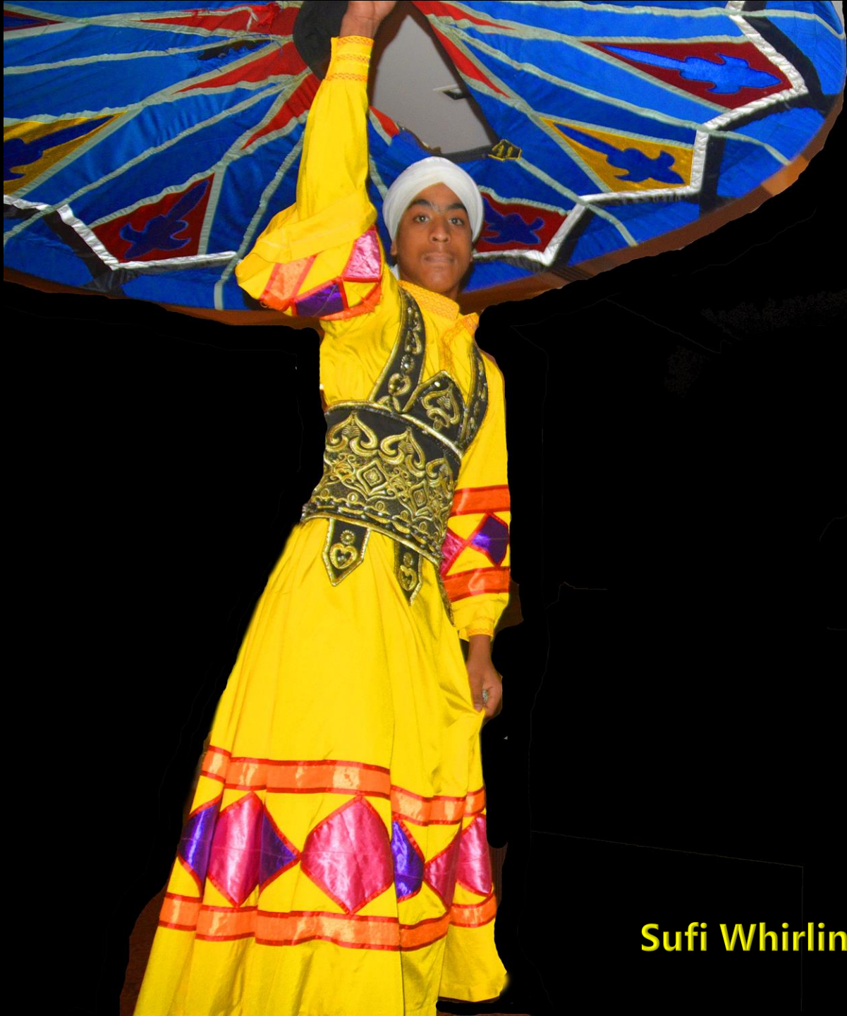
Sufi Whirling Dervish Performer