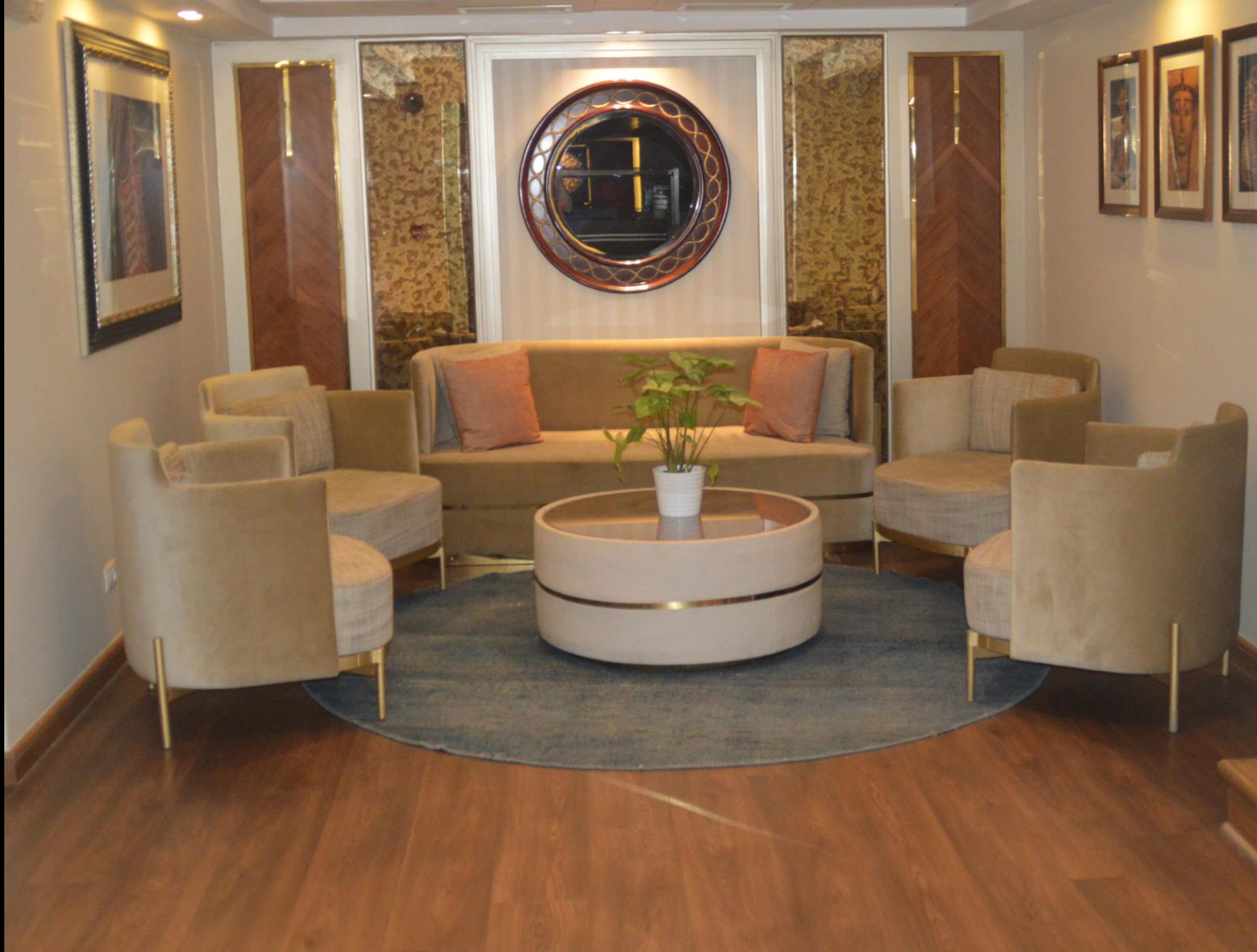
Sun Goddess Sitting Room