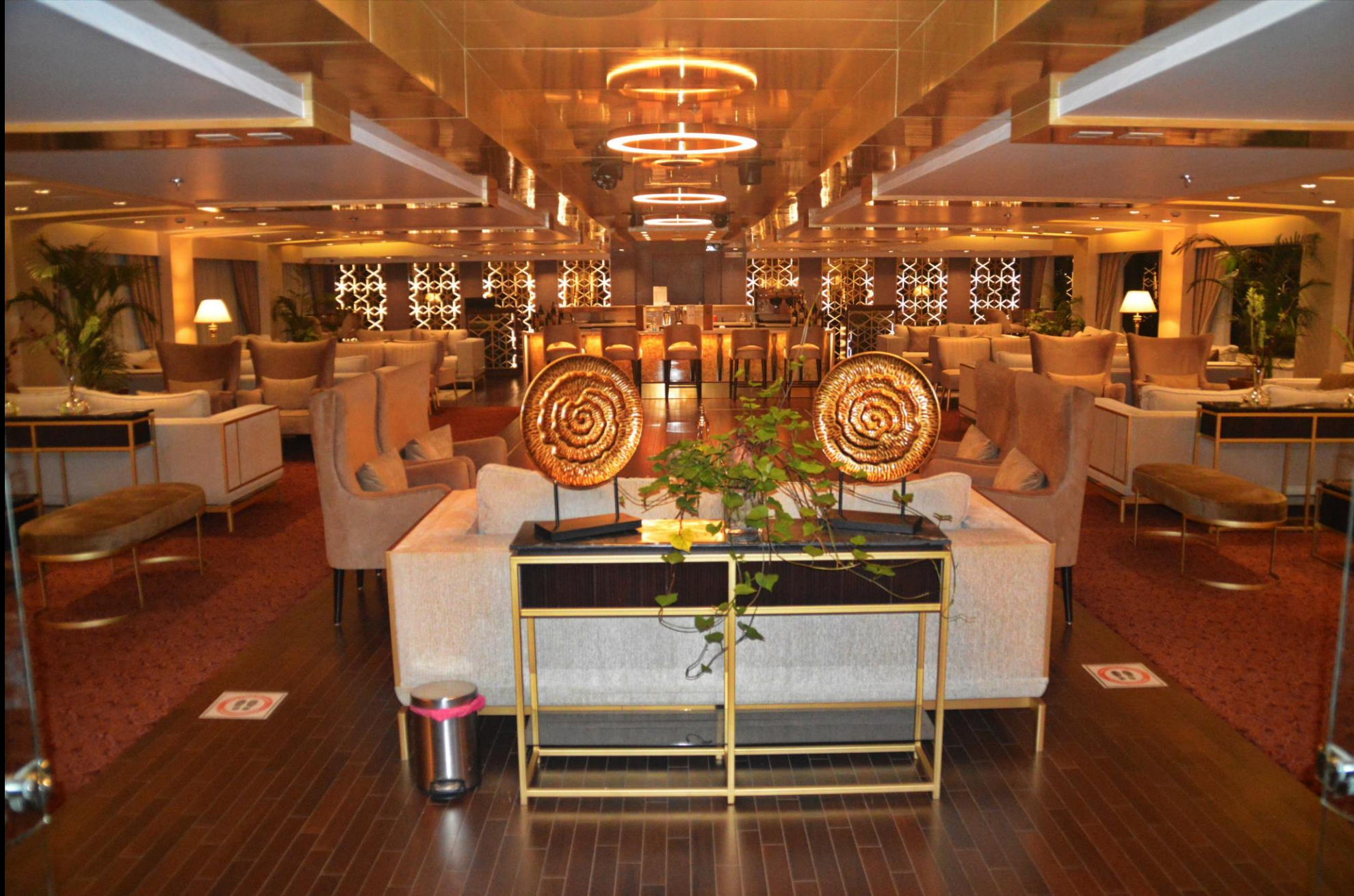
Sun Goddess Lounge