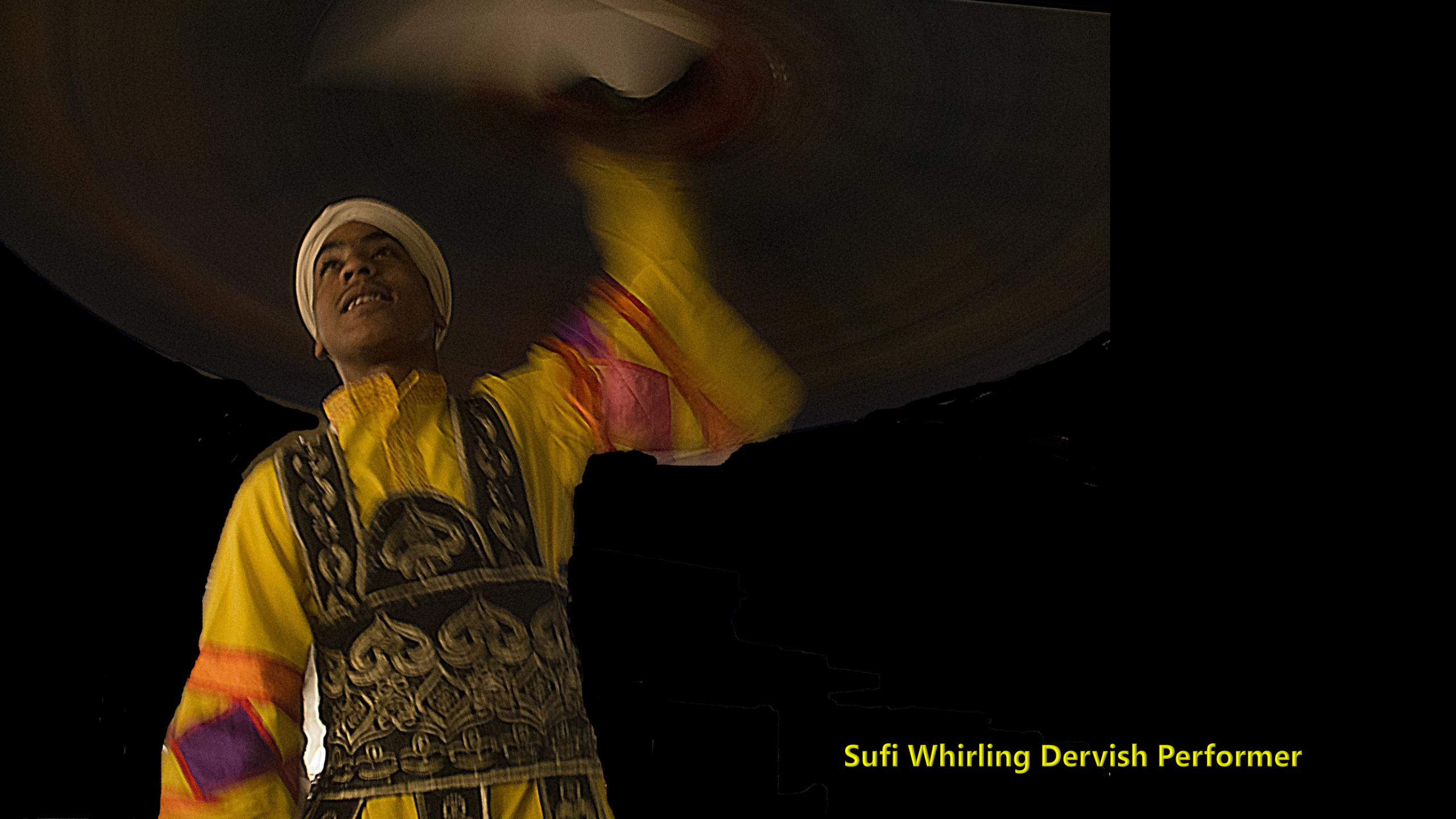
Sufi Whirling Dervish Performer