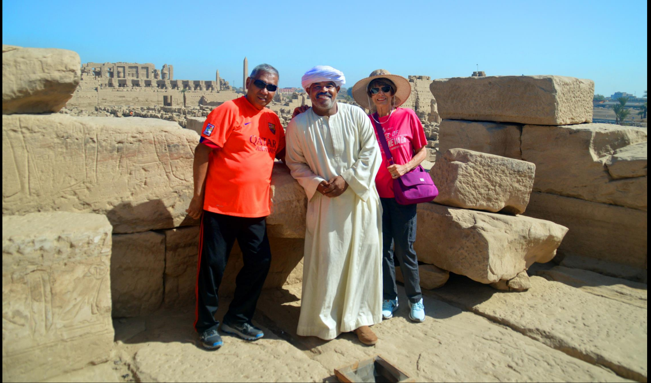
Tea with the Visionary in Karnak's Resurrection – Project Director