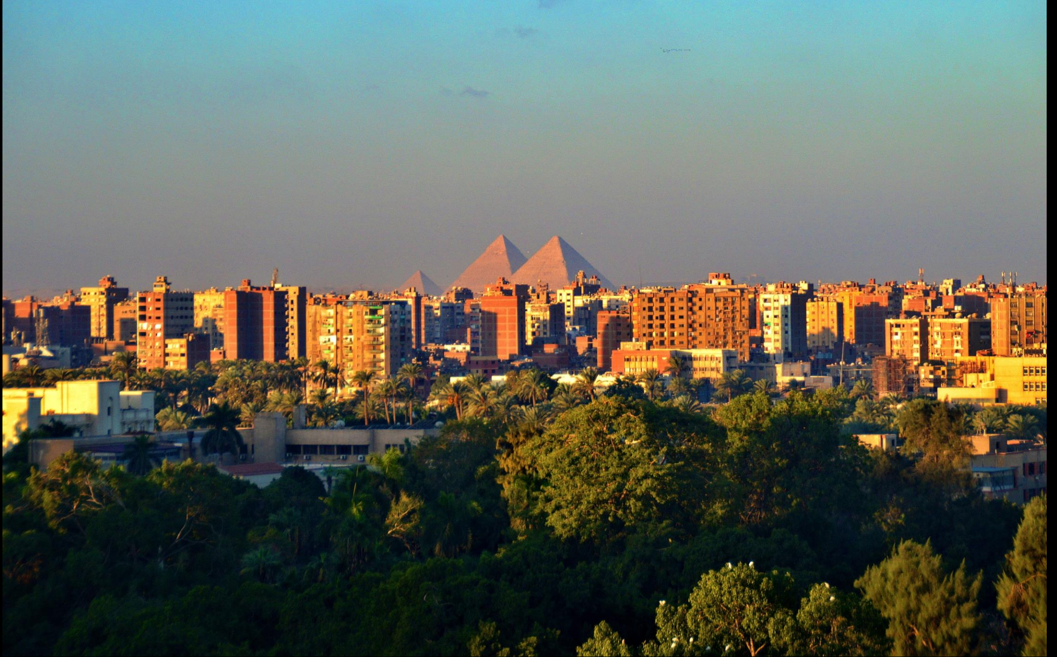
View from Our Room