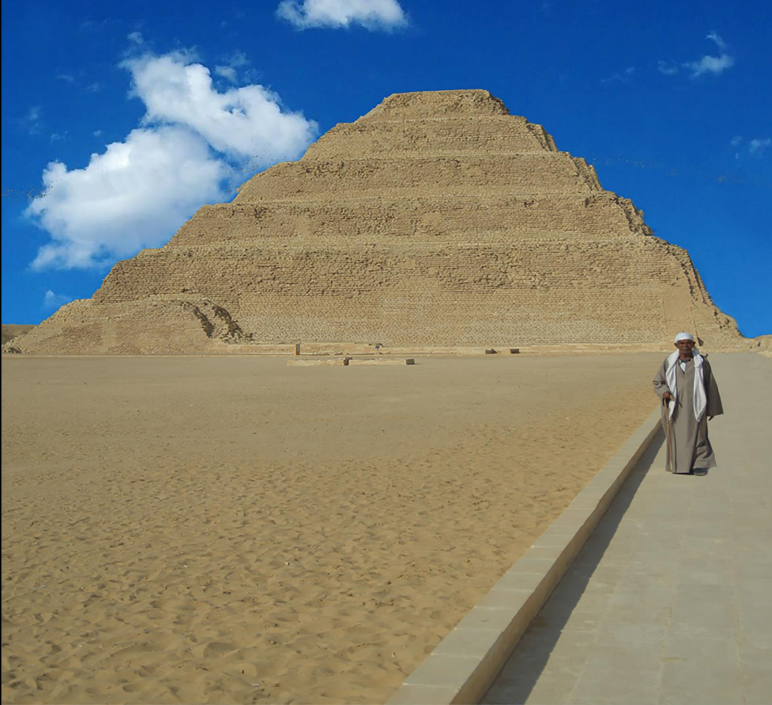
King Zoser's Steppe Pyramid @ Saqqara