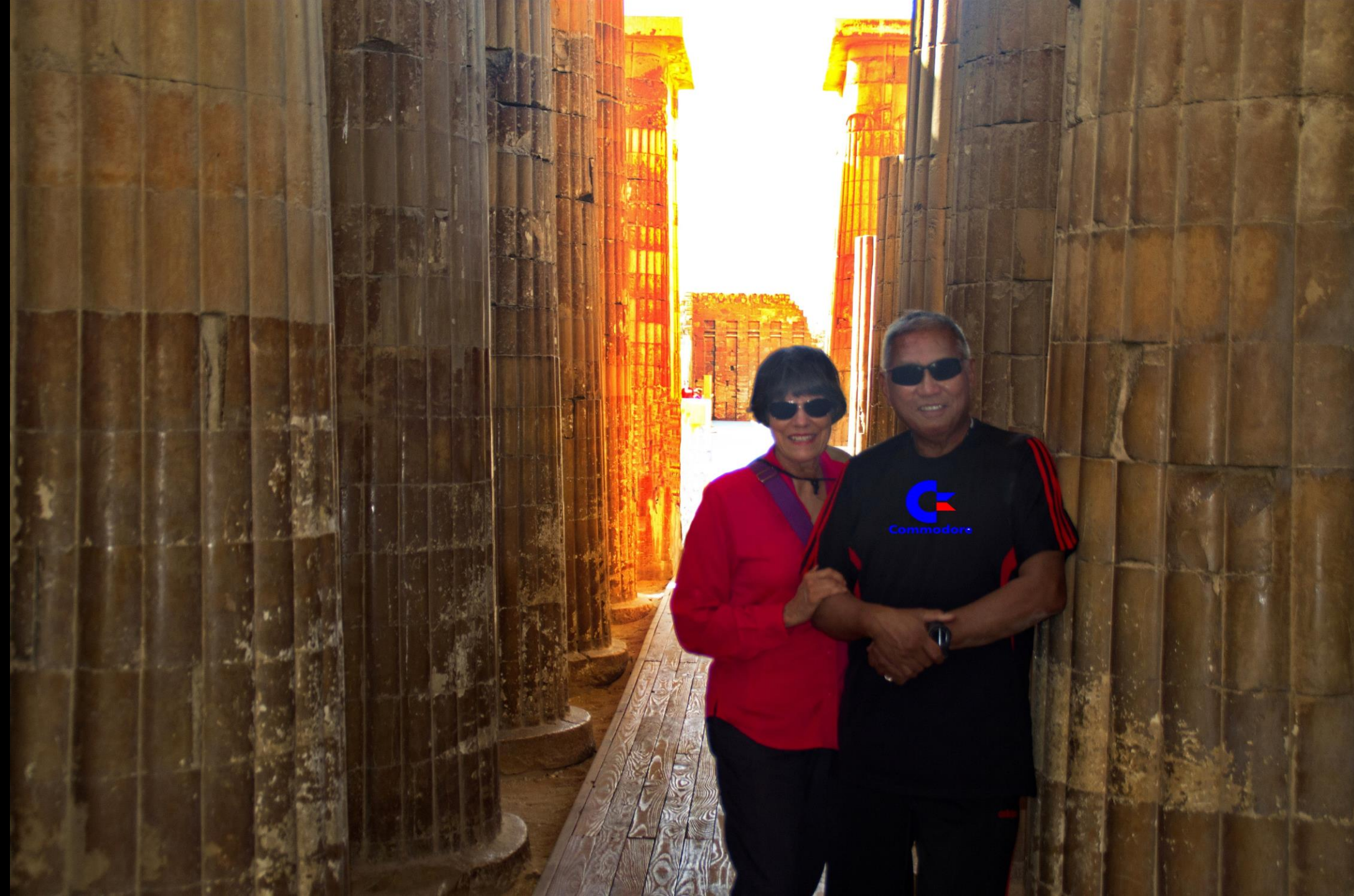
Steppe Pyramid Entrance @ Saqqara