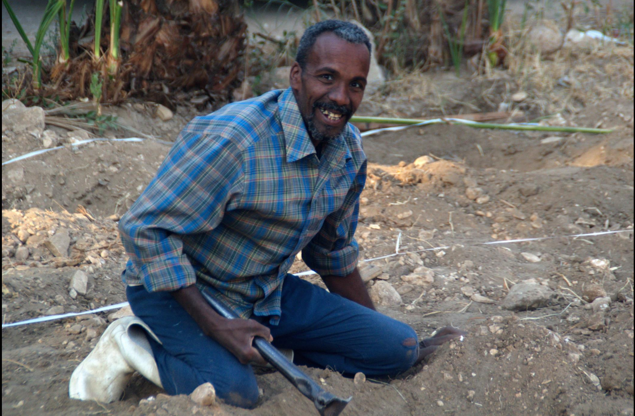
Horticulturist @ The Docks