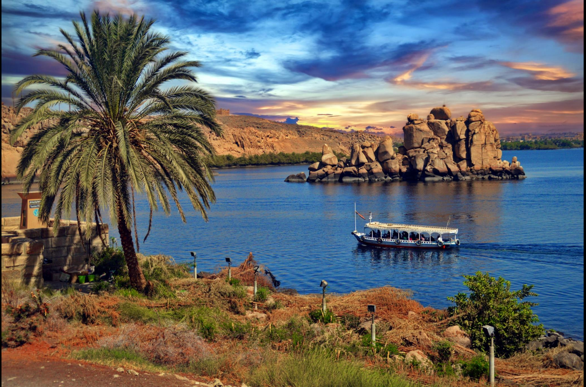
Temple of Isis – Phila Island