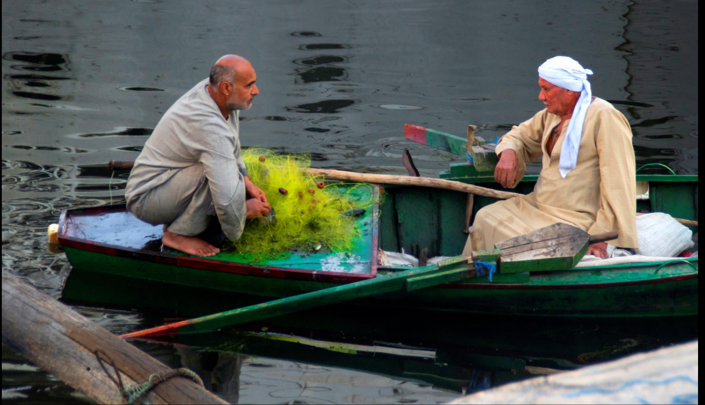
Fishermen on the Nile