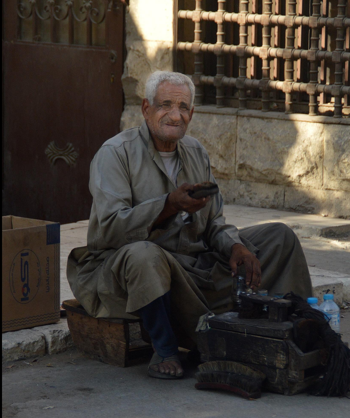
Shoe Maintenance Vendor Old Cairo Market