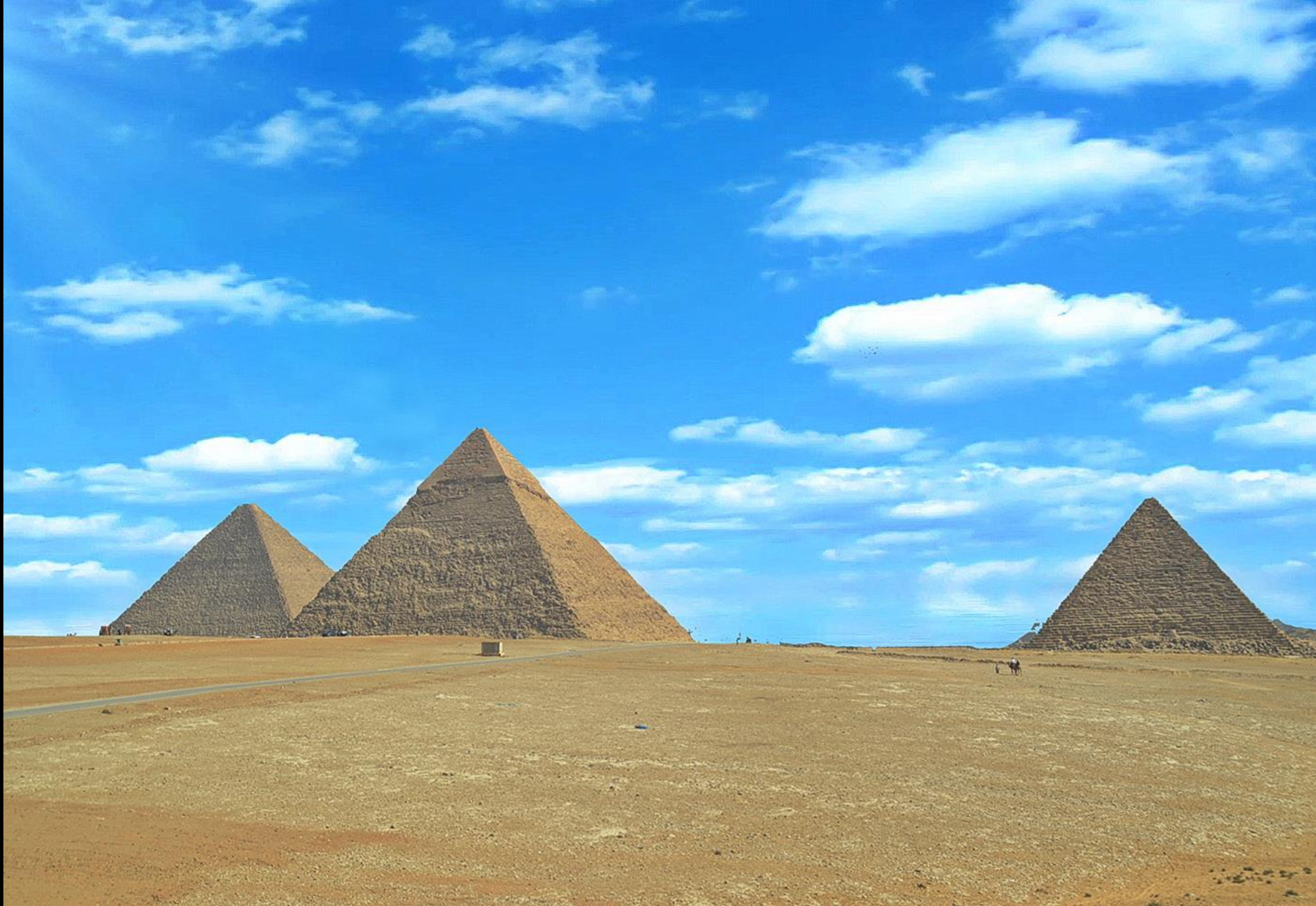
the Pyramid of Menkaure , the Pyramid of Khafre and the Great Pyramid of Khufu .