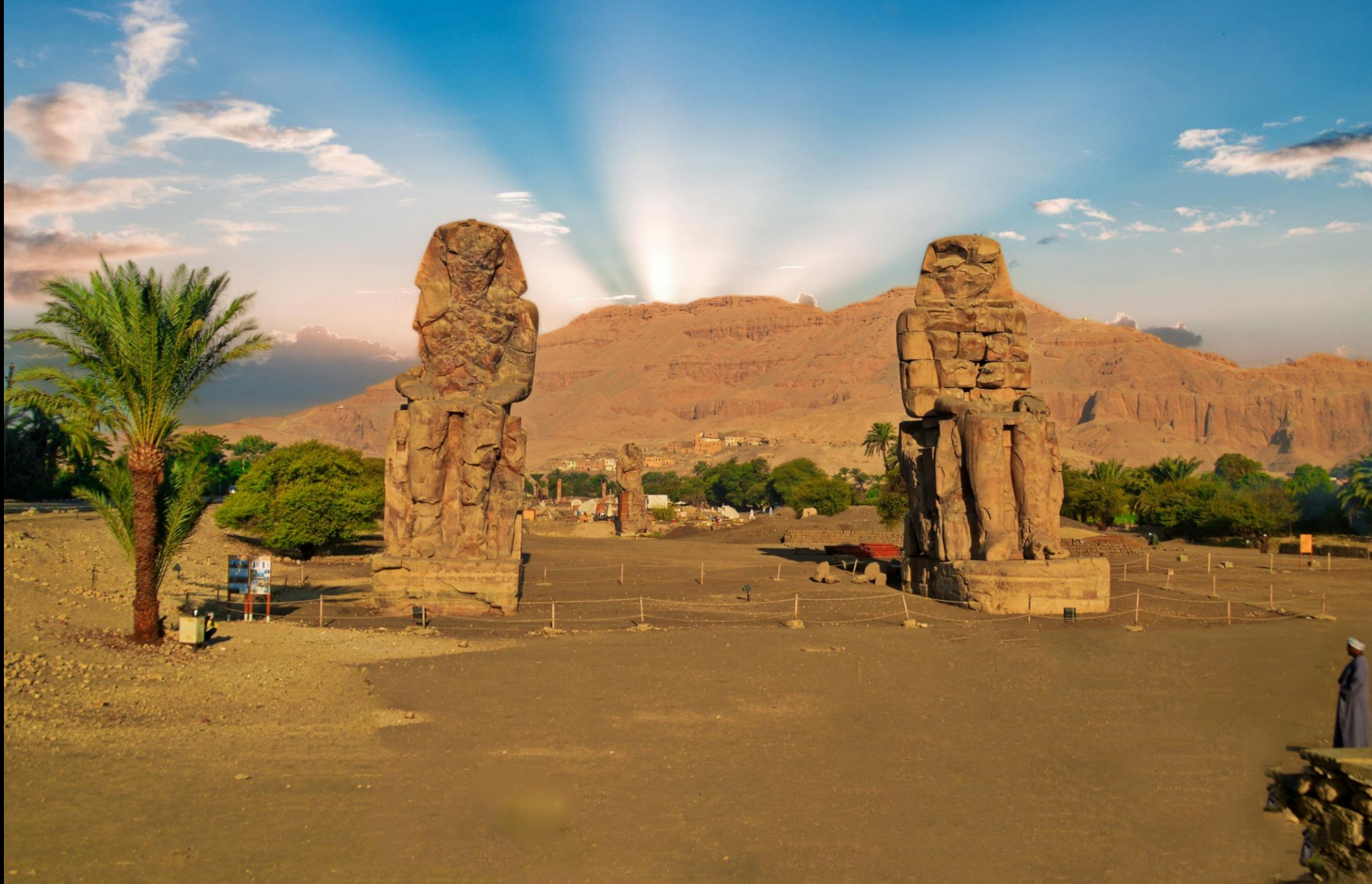
Valley of the Kings