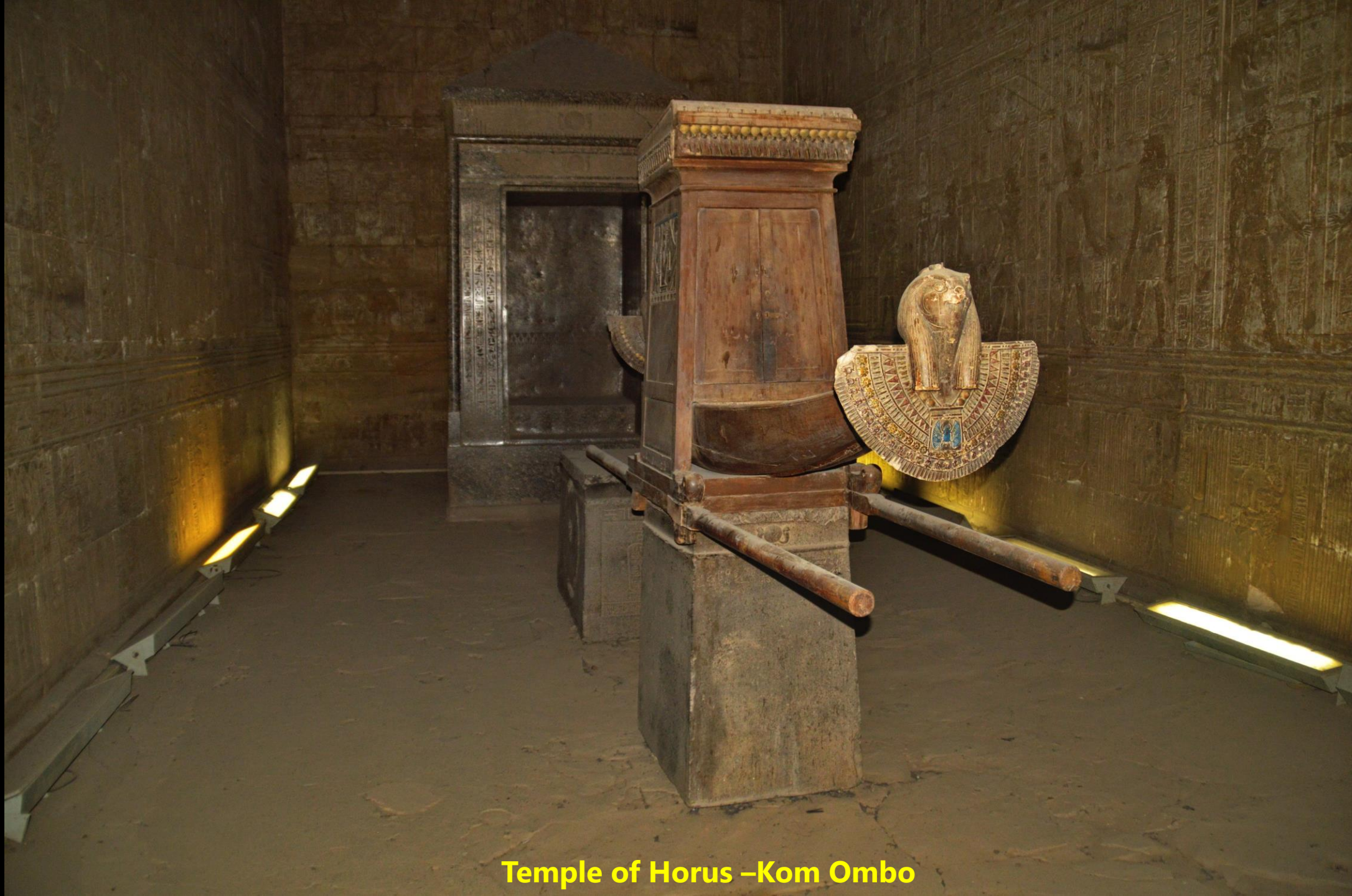
Temple of Horus –Kom Ombo