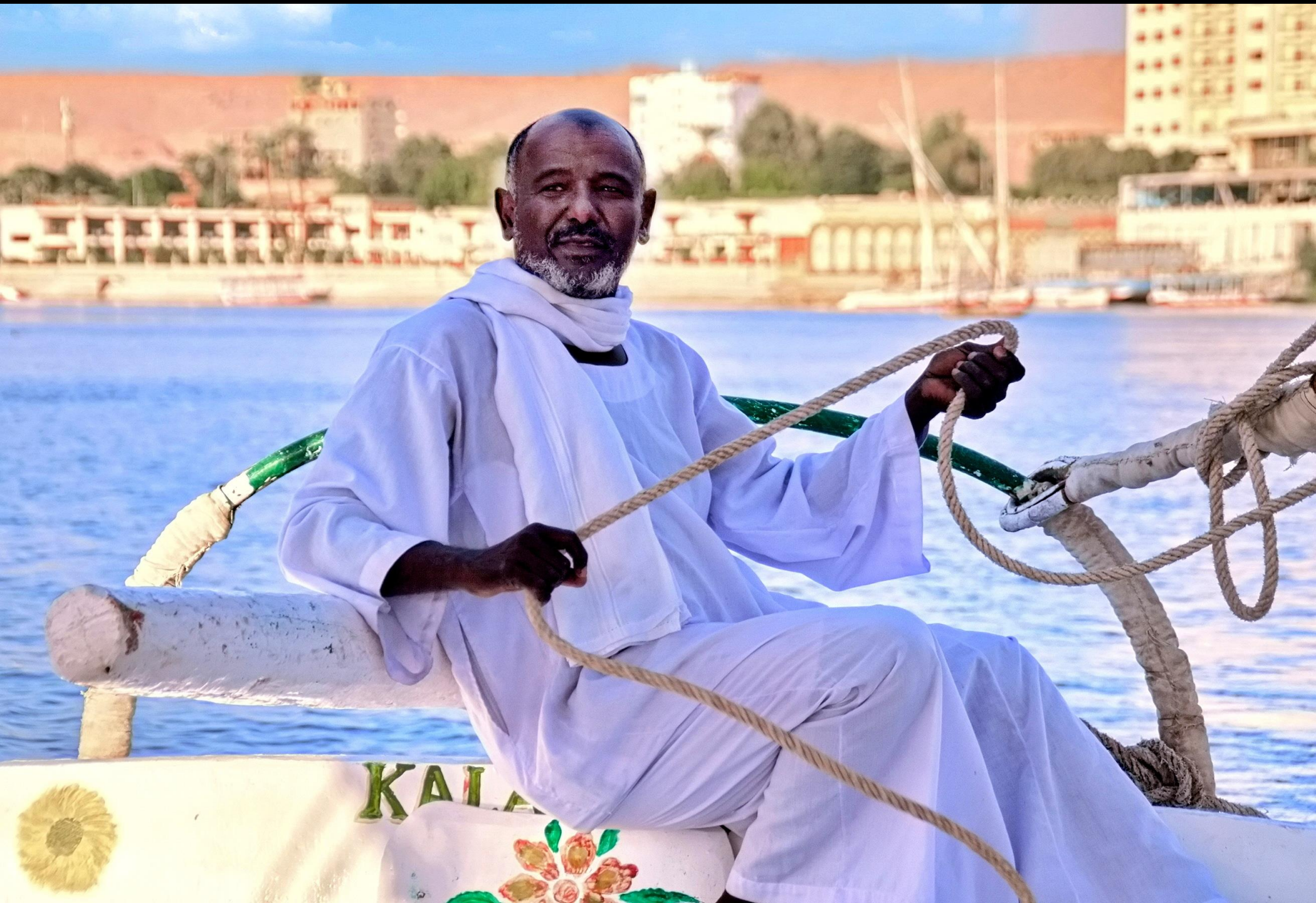
Nubian Captain Felucca Sailing to Elephantine Island