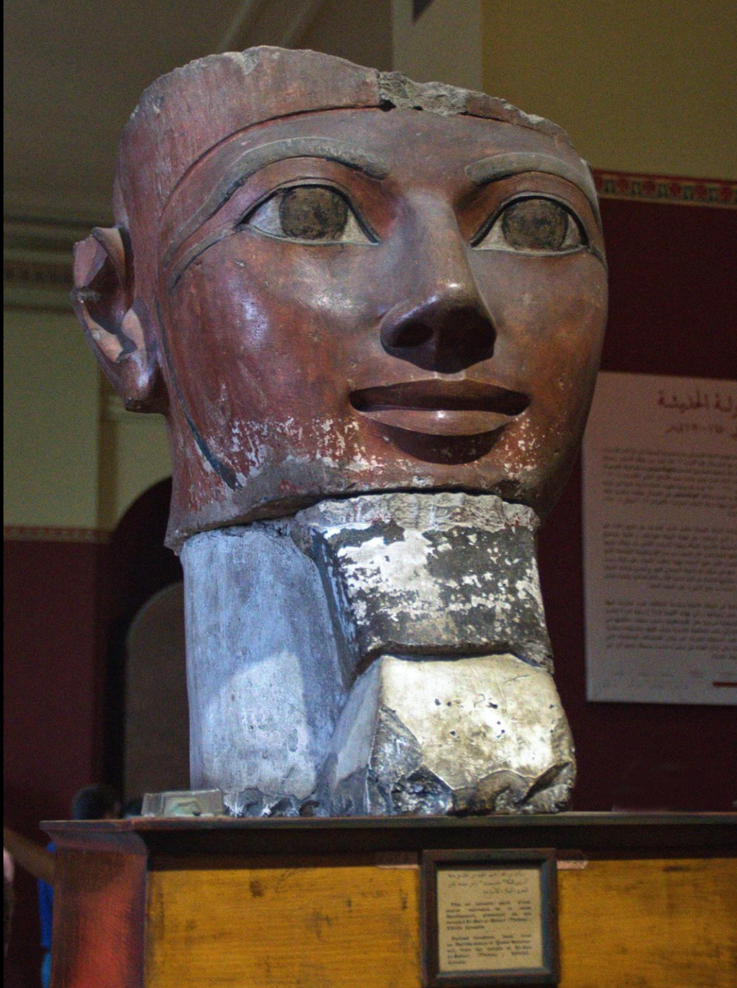
Bust of Hatshepsut @ Cairo Egyptian Museum-