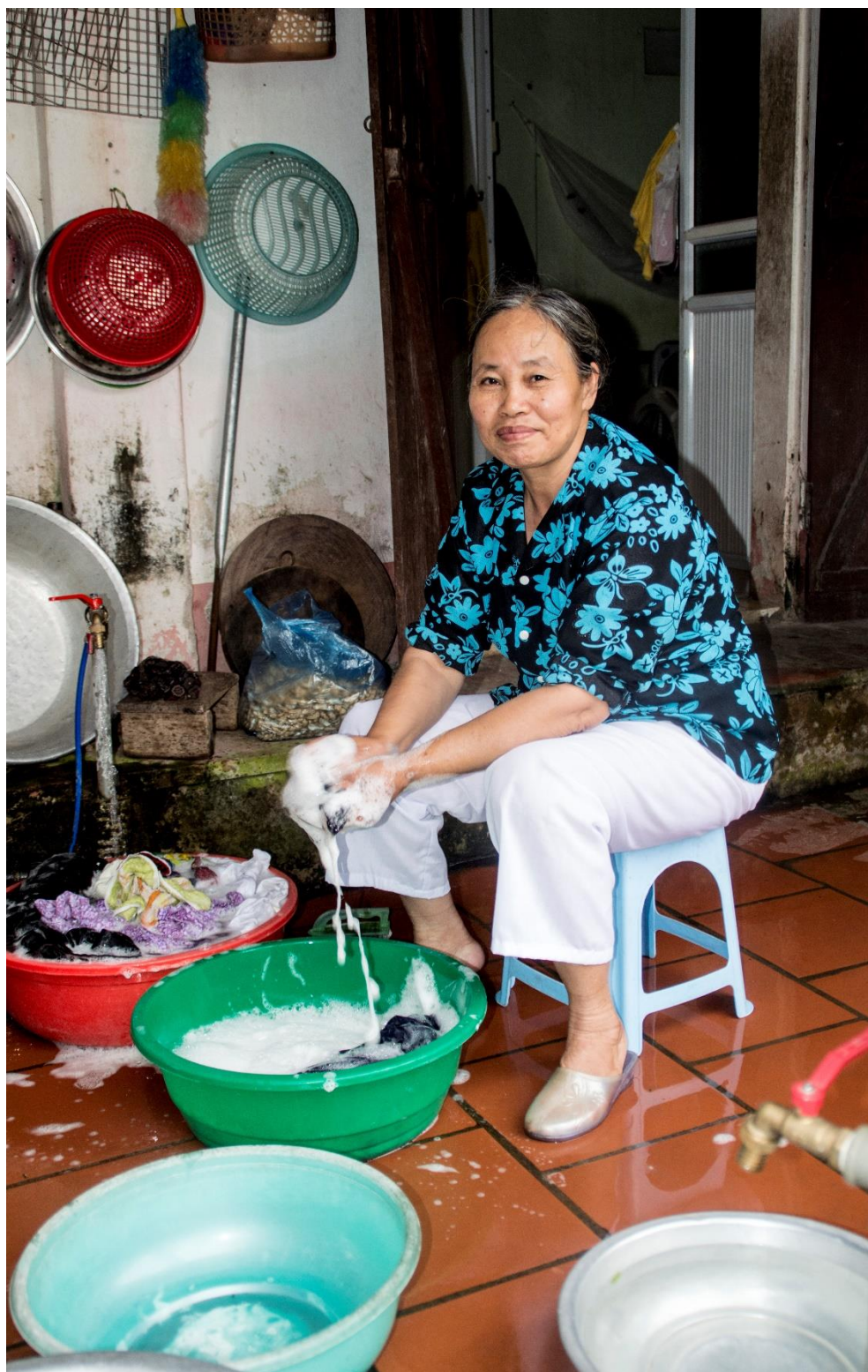
An Invitation for Tea in Ky Son