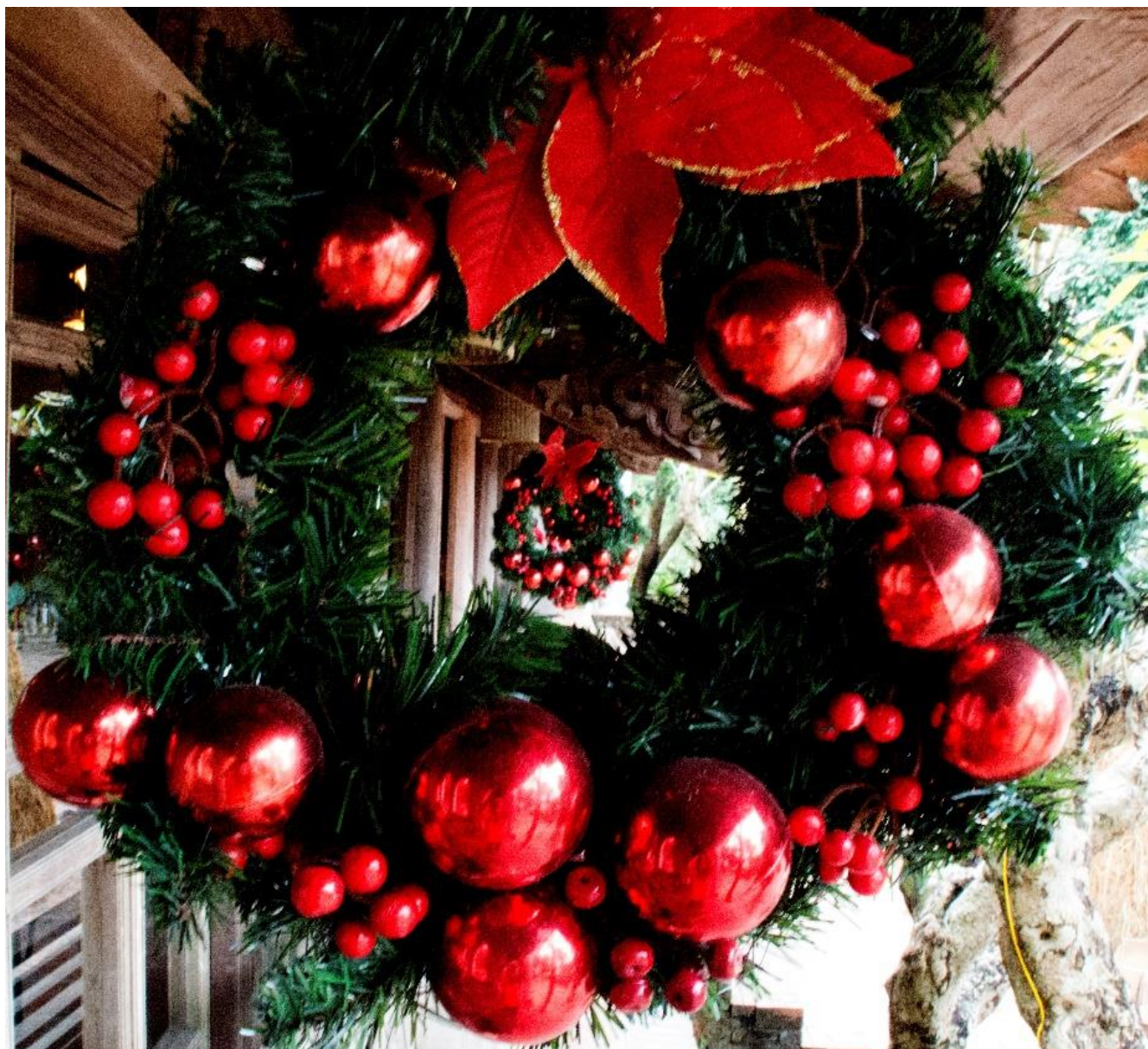
Ky Son Village Decorations