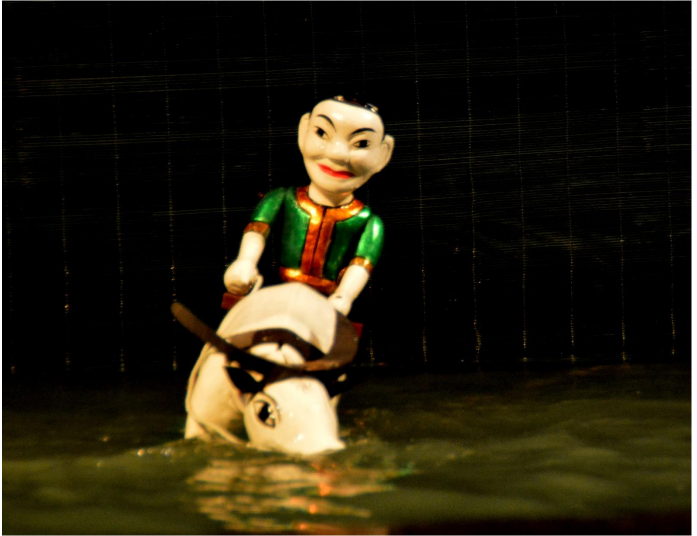
Water Puppets of Ha Noi