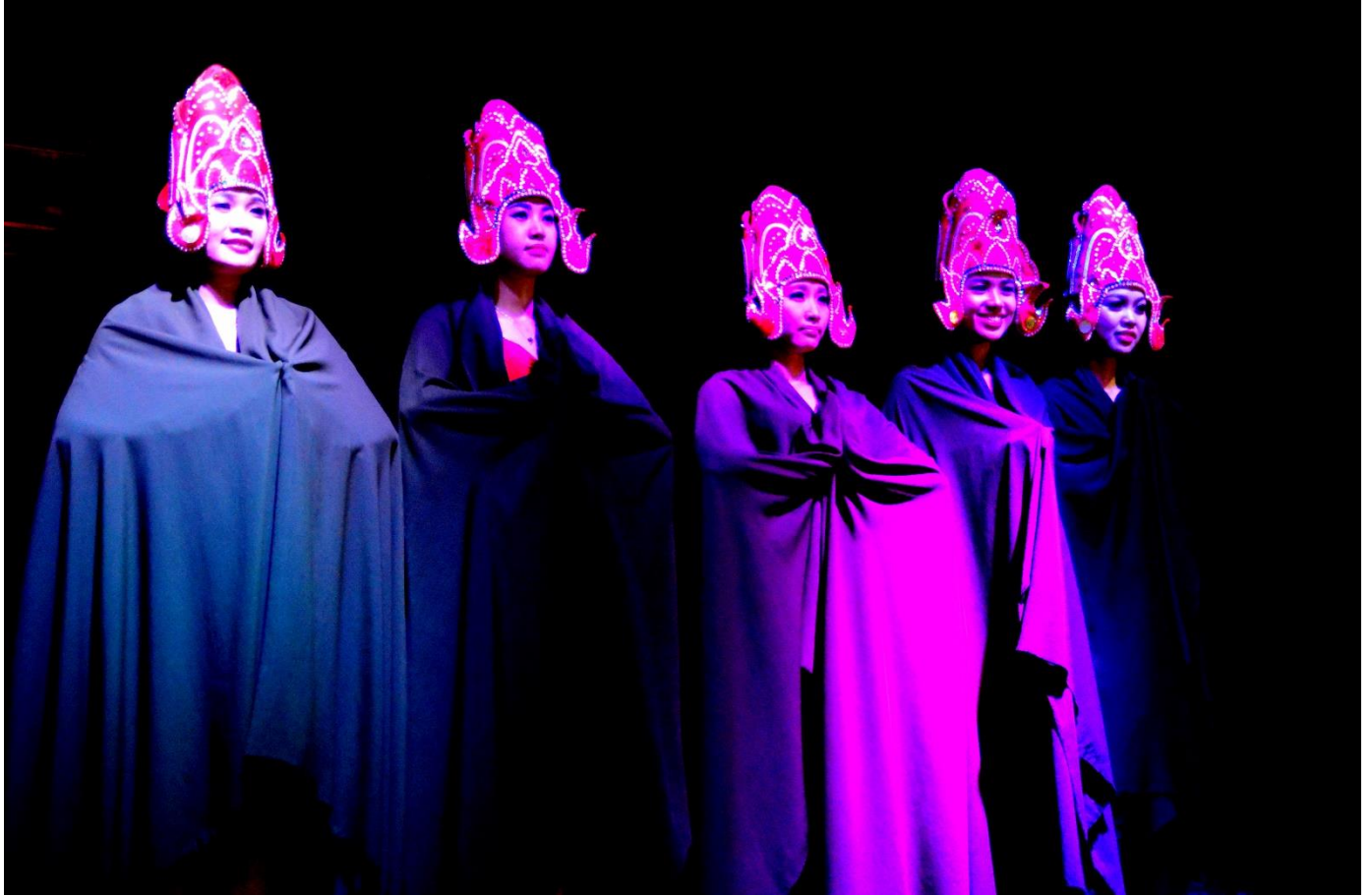
Mi Son Dance Troup