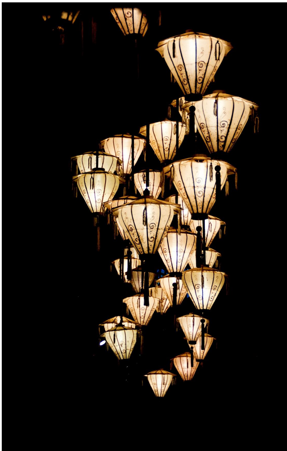
Duong Lan Ceiling Lanterns