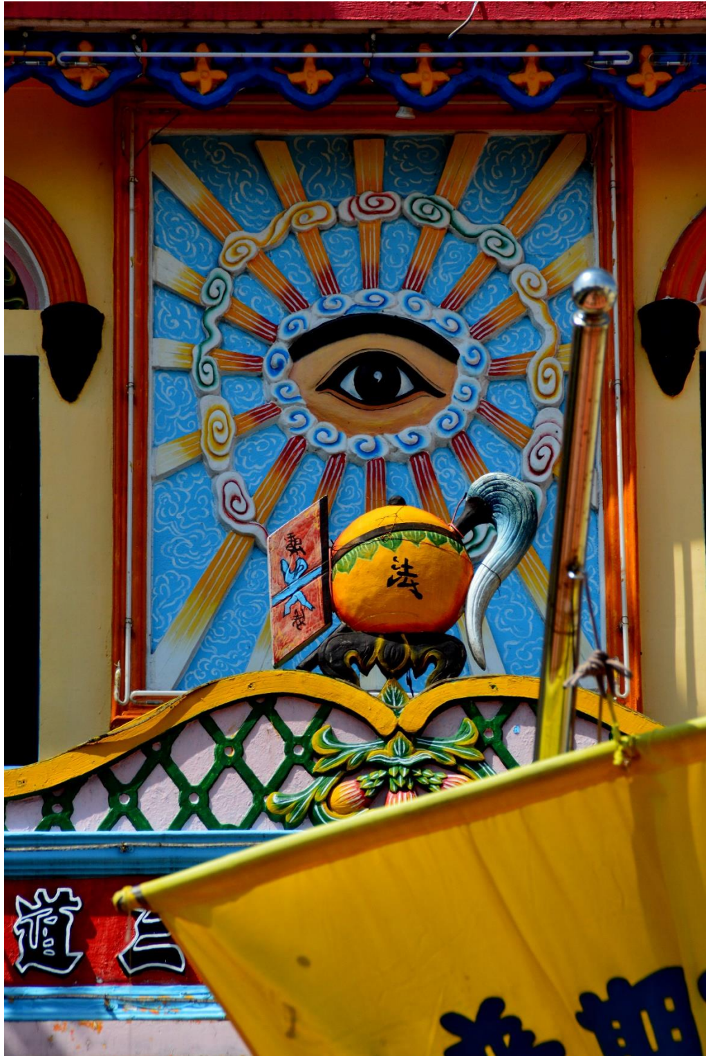
All Seeing Eye