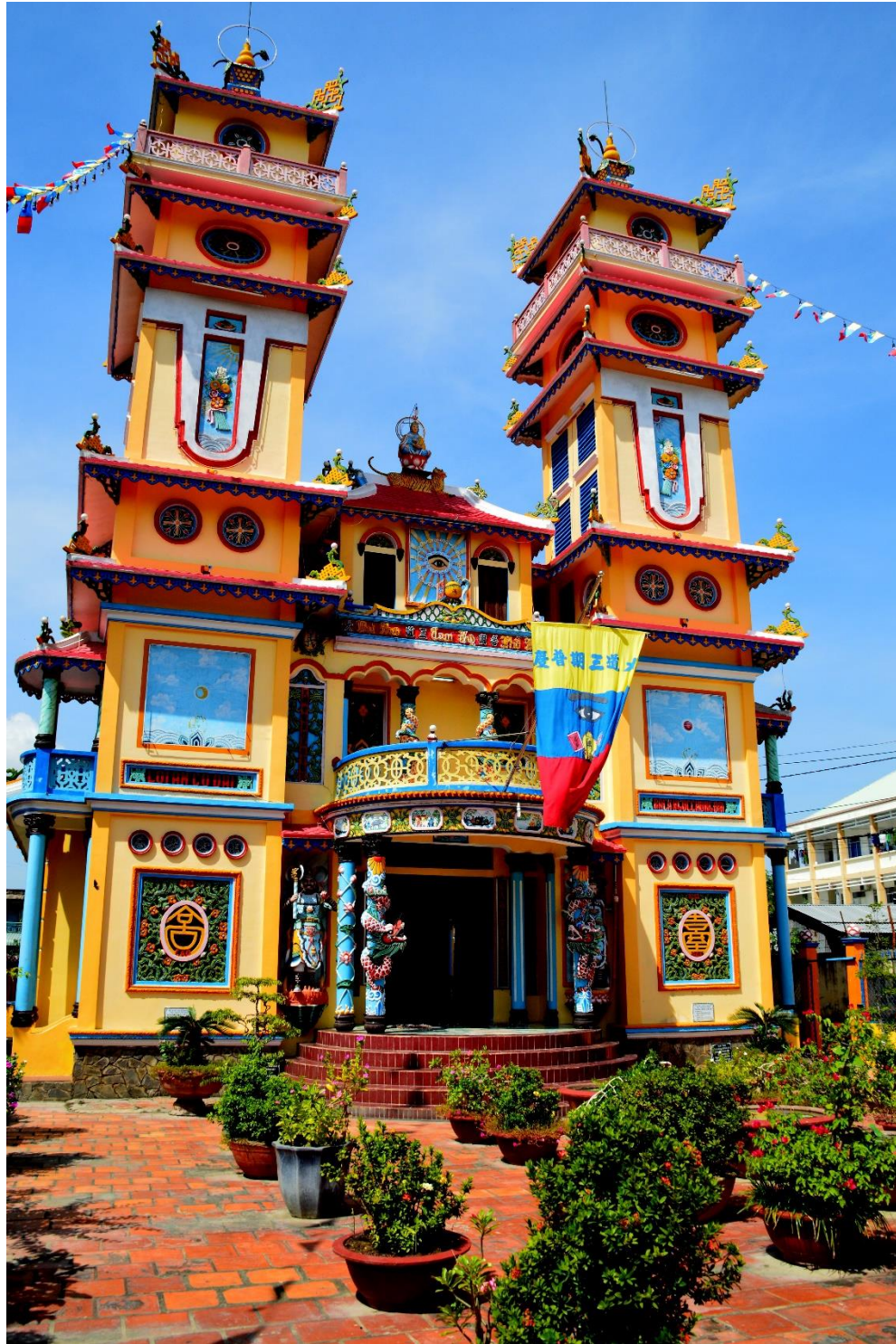
Cao Dai Temple