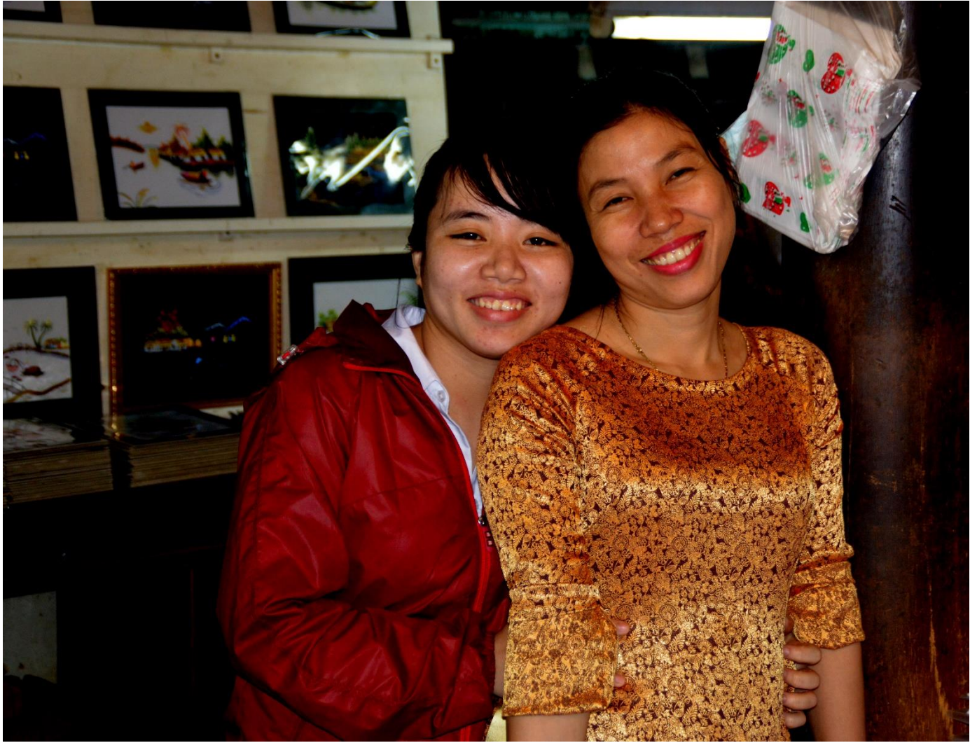
Silk Artist of Hoi An