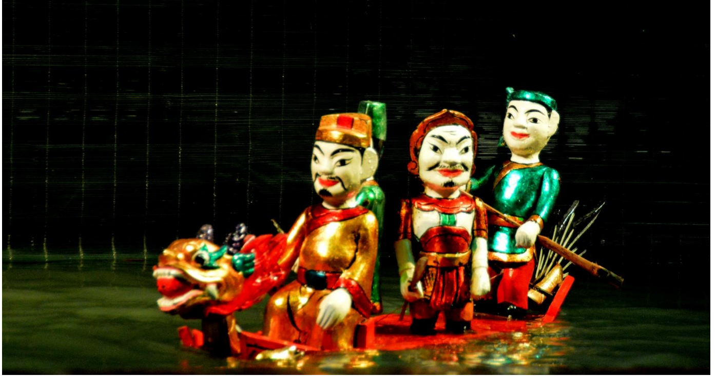
Water Puppets of Ha Noi