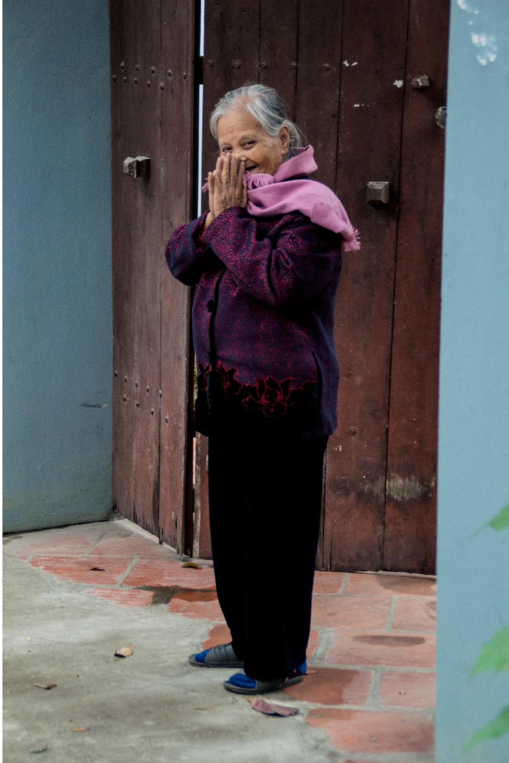
Village Elder – Ky Son