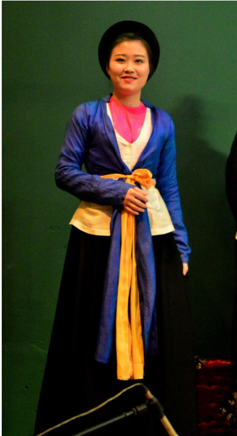
Lead Musician Puppet Show