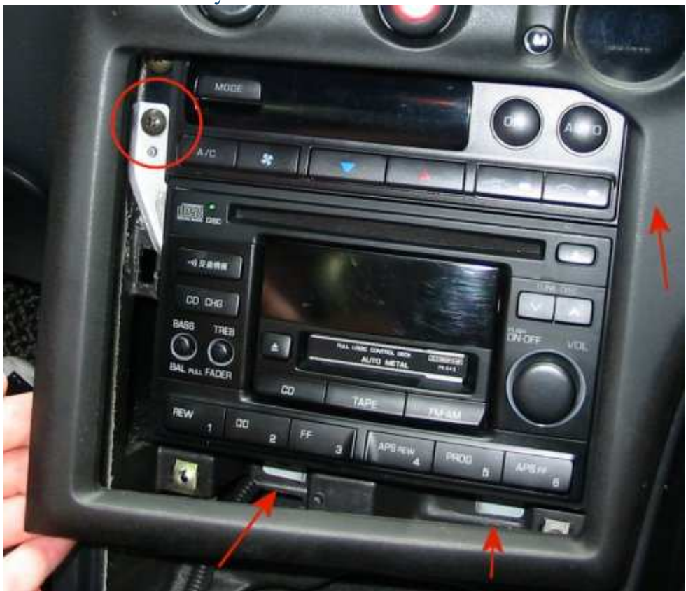
Unscrew the 4 screws holding the factory brackets.