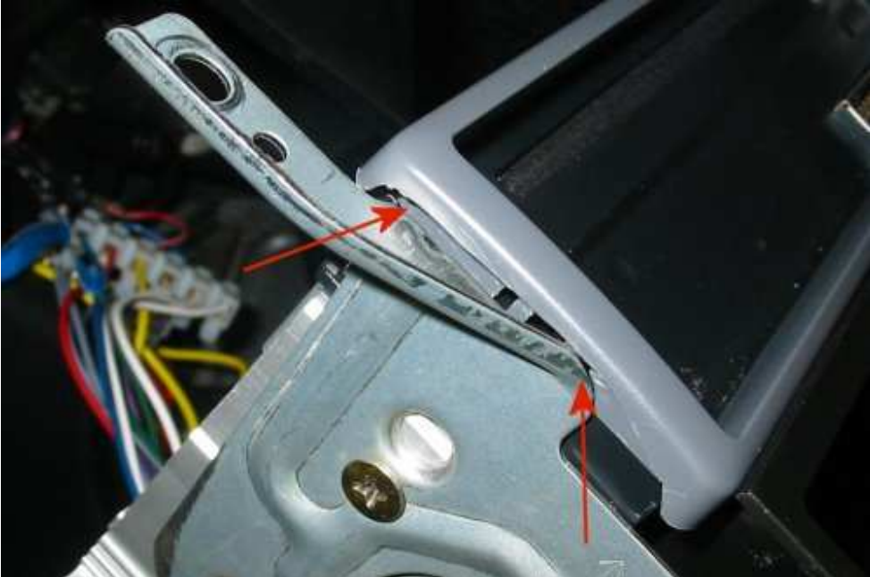
The sides of the surround needed to be removed (carefully with a chisel) so as to clear the edges of the mounting bracket.