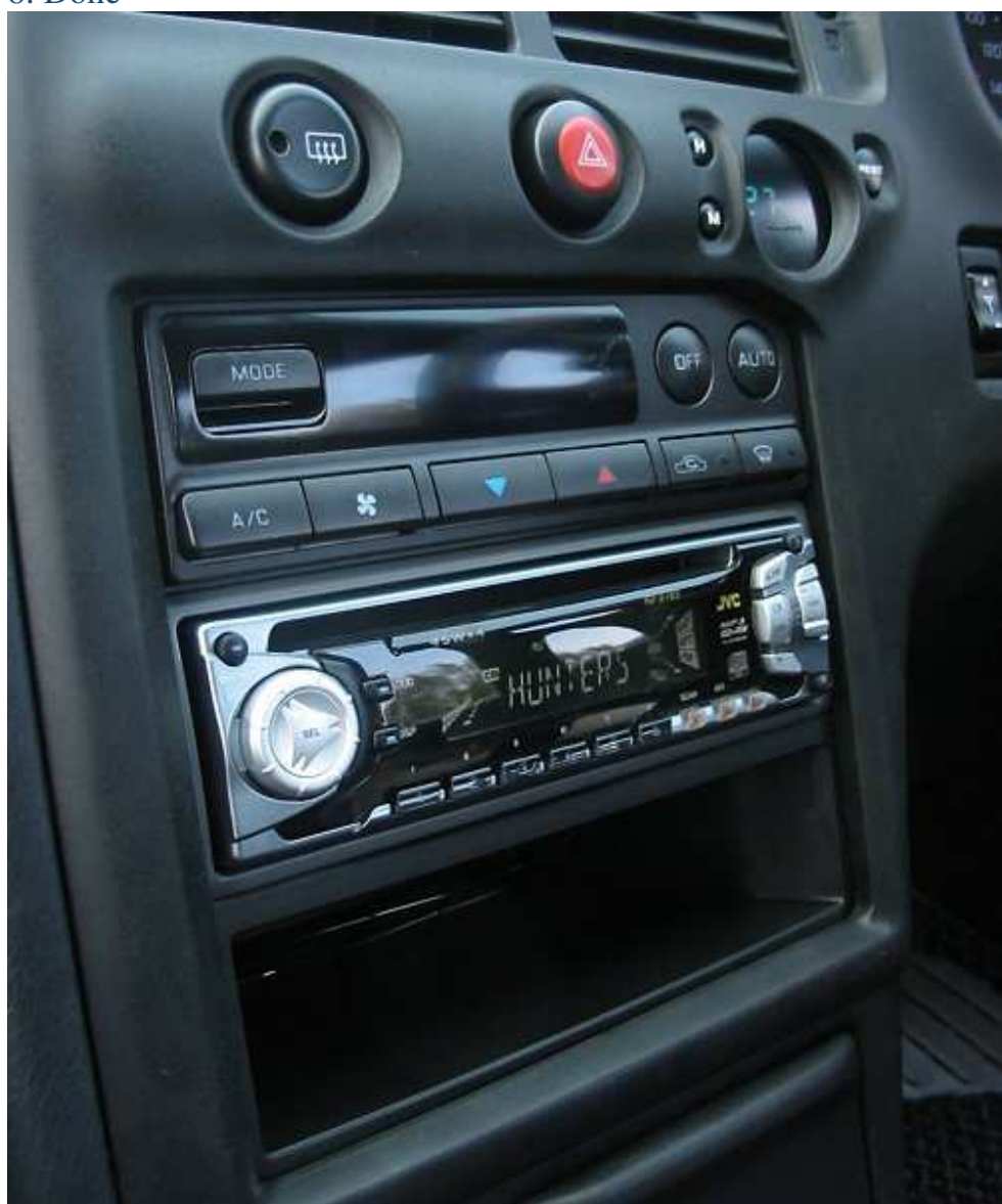
Final Installation. Nice work