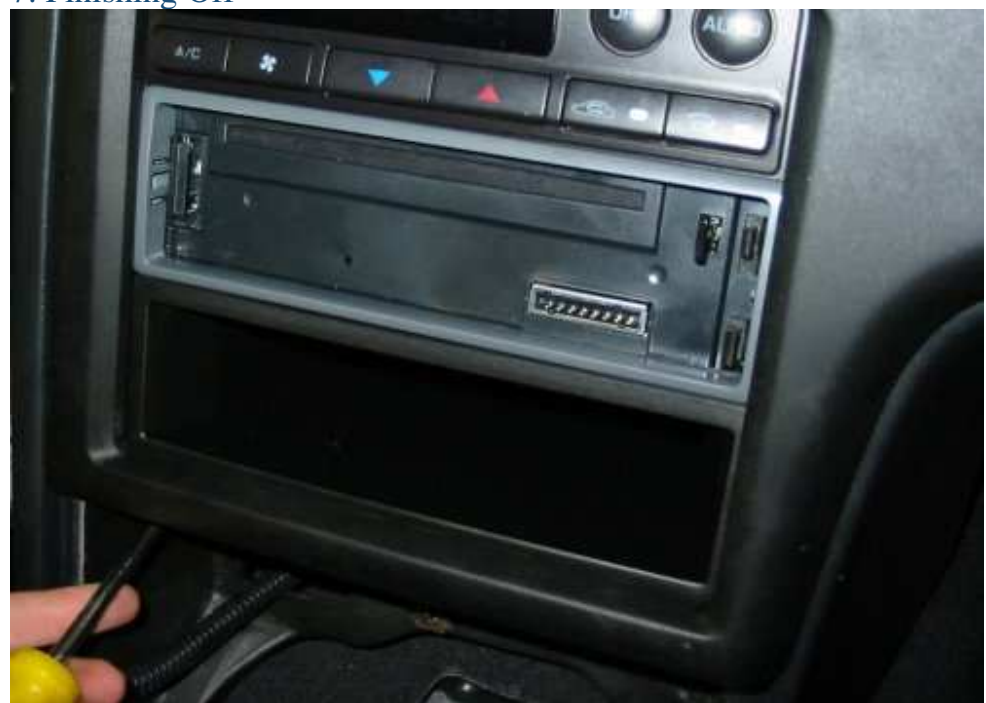
Replace console surround (carefully) and screw both (2) screws back in. Replace gear stick surround and screw in single screw. Put back ash tray and screw on gear-knob.