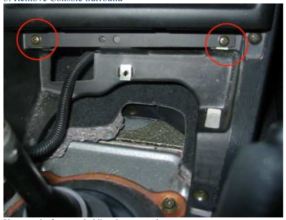
Unscrew the 2 screws holding the surround.