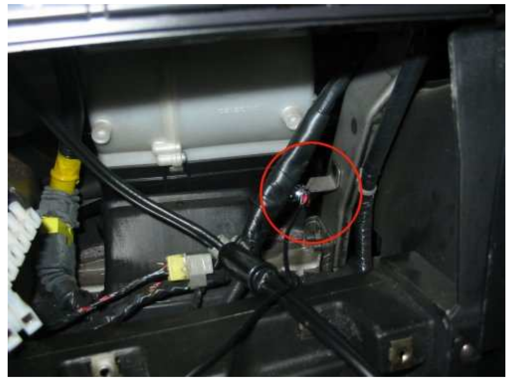
Connect unit Ground to chassis, I used this point as it already has a hole and is easily accessible. For a stronger ground consider using the larger bracket or further down towards the gearbox.