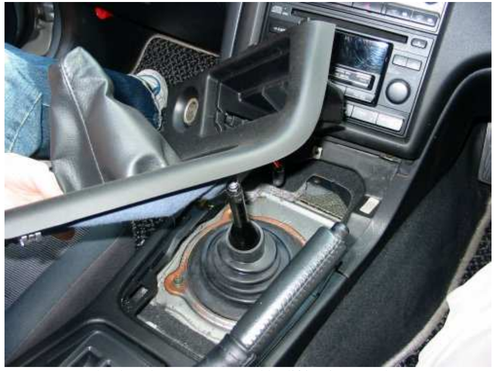
Unscrew gear-knob and remove surround by lifting it upwards.