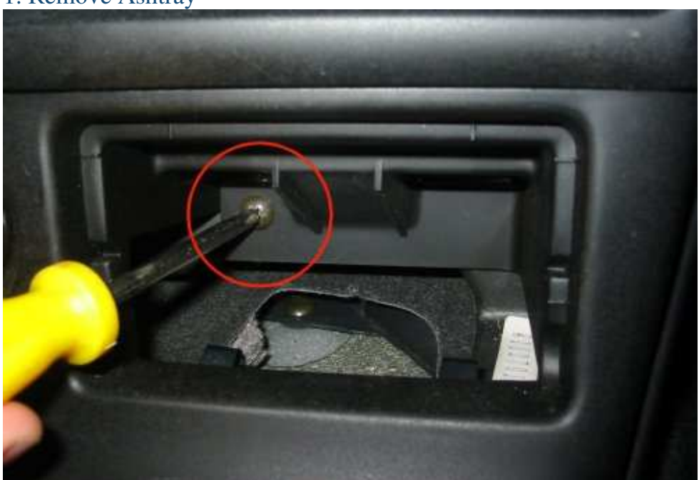
Remove ash tray and unscrew the single screw shown above.