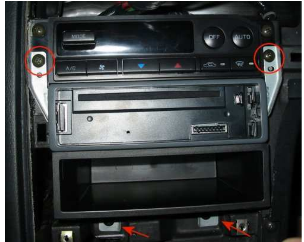
Mount the Unit back into the console using the 4 screws taken out previously.