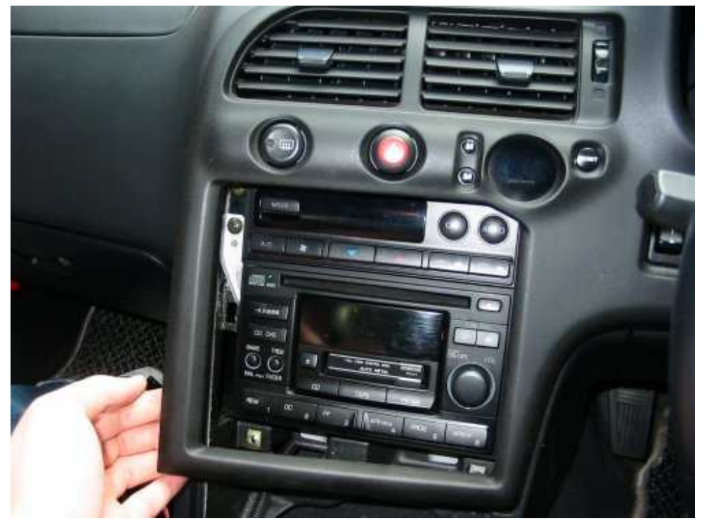
Remove Console Surround by lifting from bottom edge. This whole section (to the driver's door) can be lifted out enough to remove the factory stereo.