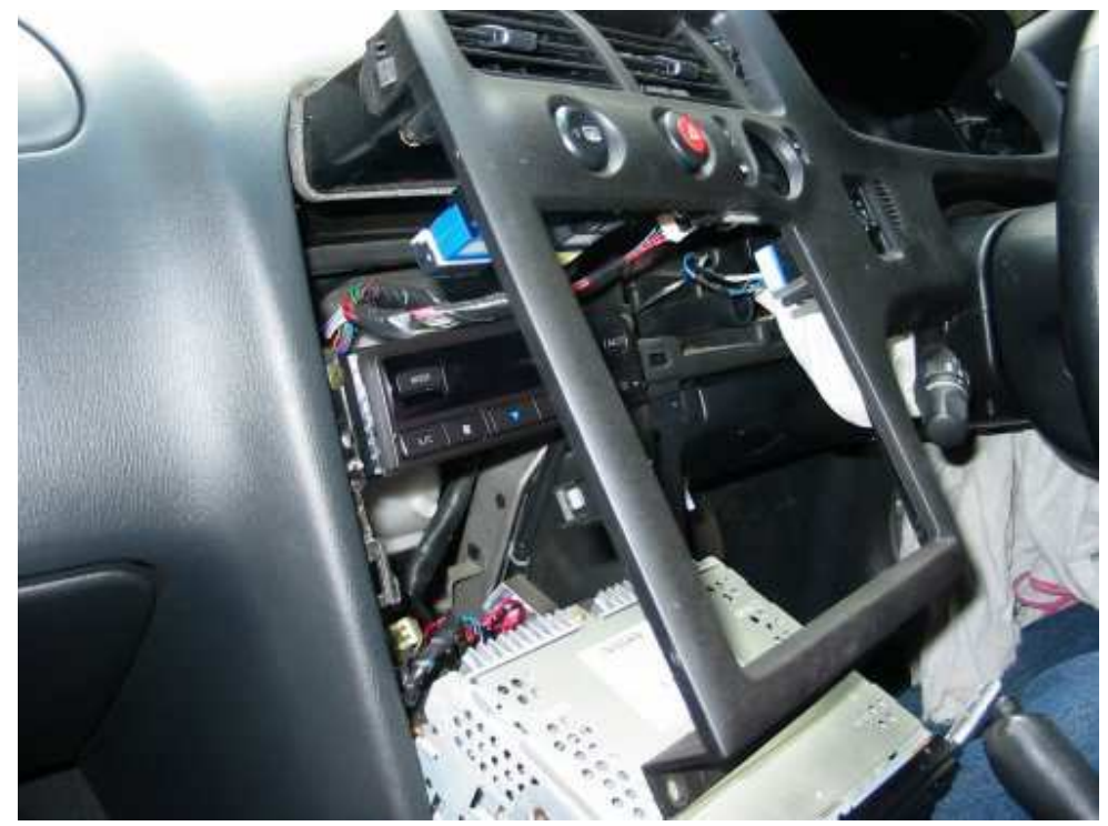
Remove the factory unit.