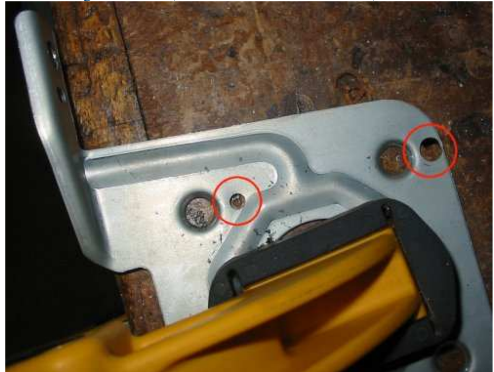
As the JVC has a large surround (for the detachable face) I needed to redrill the mounting holes 10mm back so unit lined up properly.

6. Mounting New Unit (in this case a JVC KD-S785)